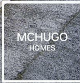
Evergreen, 193 Bromsgrove Road, Hunnington, West Midlands, B62 0JS