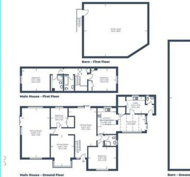
Illustration for identification purposes only, measurements are approximate, not to scale. © CJ Property Marketing Produced for Fine Homes Property

Approximate Gross Internal Area Main House - Ground Floor = 167.2 sq m / 1,800 sq ft Main House - First Floor = 56.0 sq m / 603 sq ft Barn - Ground Floor = 441.5 sq m / 4,752 sq ft Barn - First Floor = 85.2 sq m / 917 sq ft The Outback, Property Two = 223.8 sq m / 2,409 sq ft Total = 973.7 sq m / 10,481 sq ft