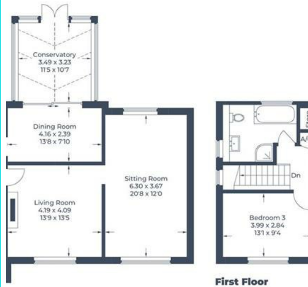
Illustration for identification purposes only, measurements are approximate, not to scale. © CJ Property Marketing Produced for Fine Homes Property

Approximate Gross Internal Area Ground Floor = 94.2 sq m / 1,014 sq ft First Floor = 80.5 sq m / 866 sq ft Outbuildings = 23.1 sq m / 249 sq ft Total = 197.8 sq m / 2,129 sq ft (Including Garage)