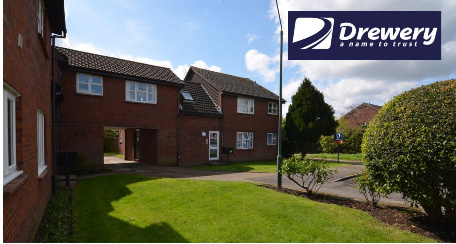
14 Kirkland Close, Sidcup, DA15 8TP £1,100pcm