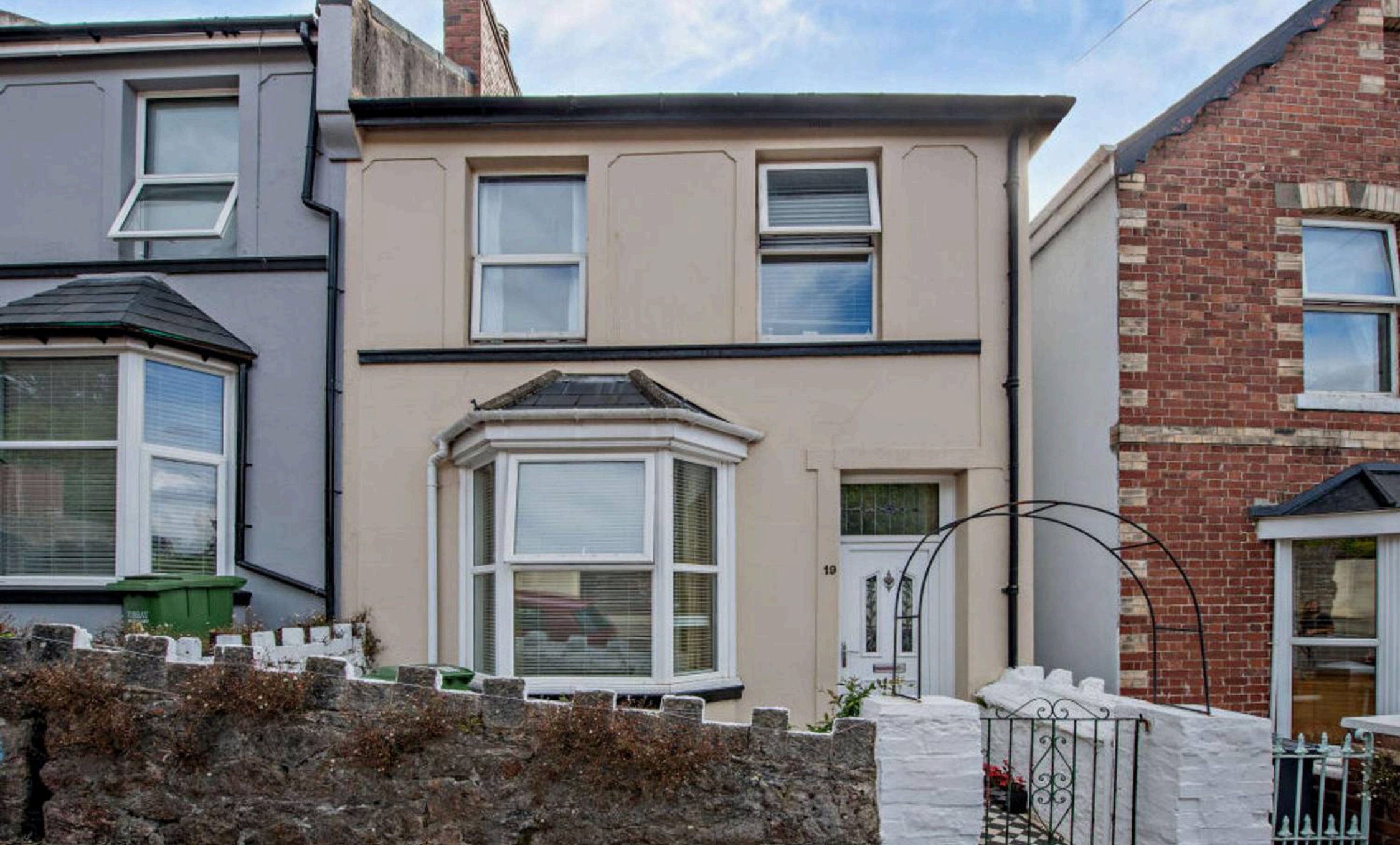
19 Lower Shirburn Road, Torquay – TQ1 3ET £235,000