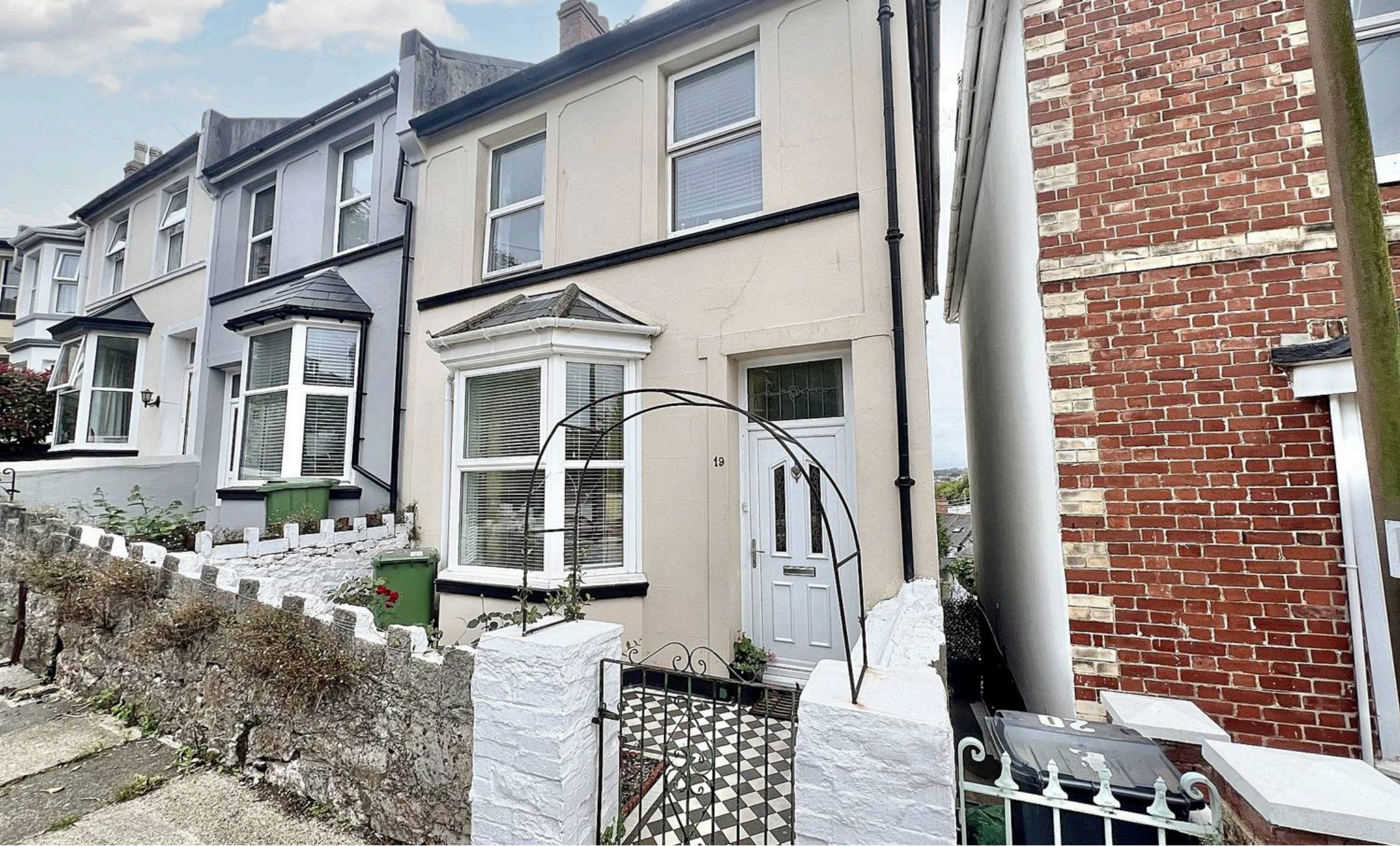
19 Lower Shirburn Road, Torquay – TQ1 3ET £230,000