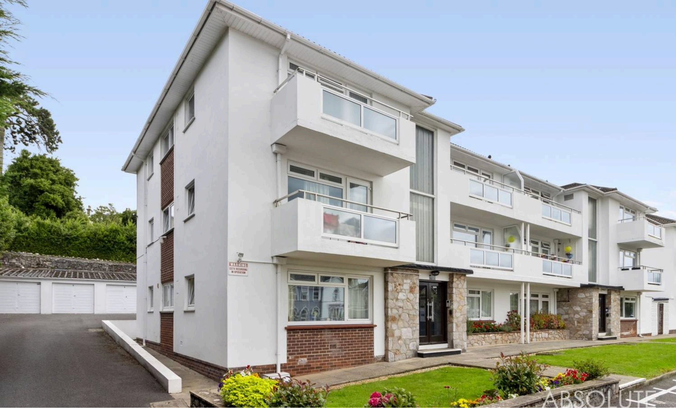
Elizabeth Court, Avenue Road, Torquay – TQ2 5LD £155,000