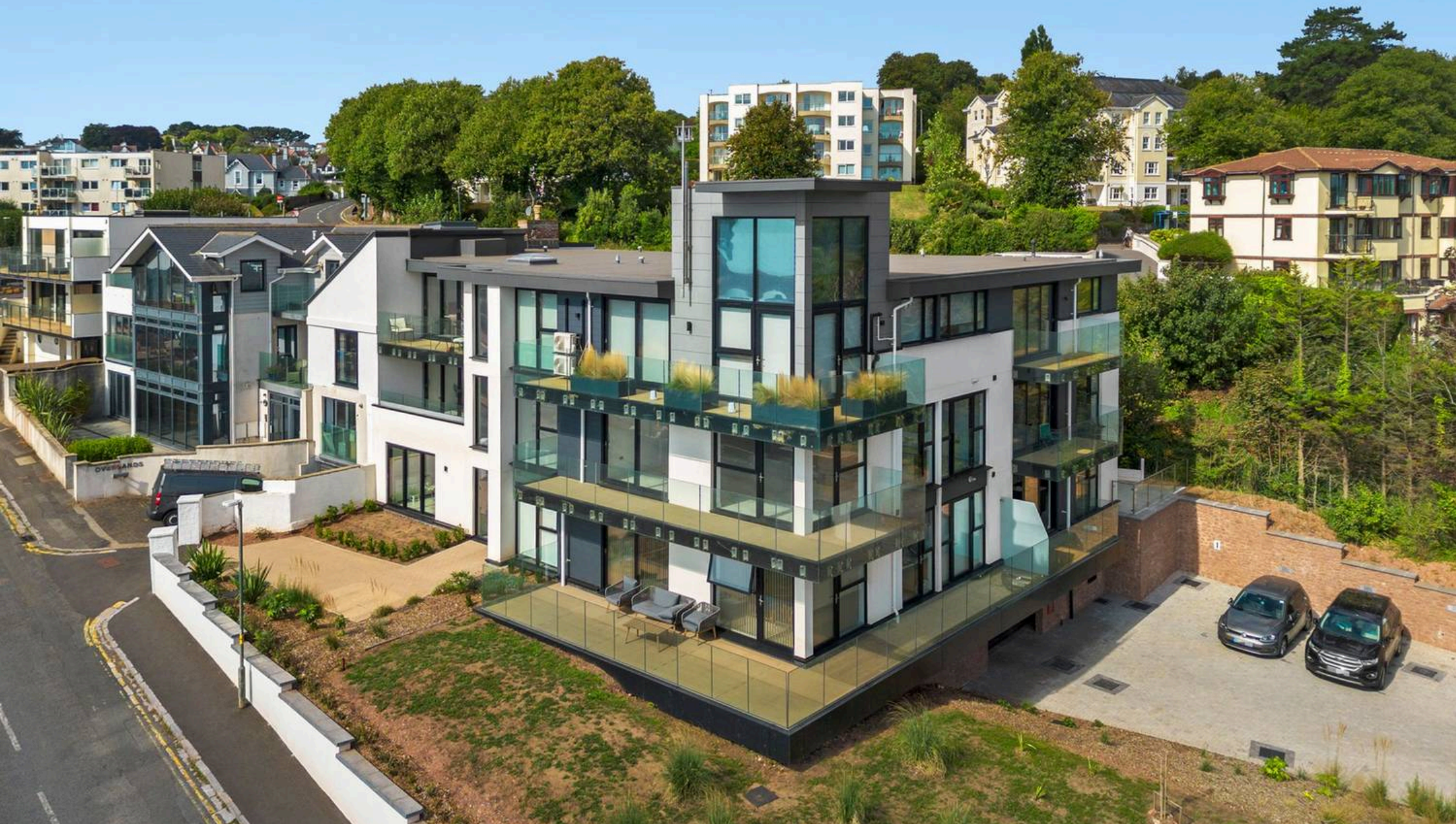
Apt 8, La Rosaire Livermead Hill, Torquay – TQ2 6QX £475,000