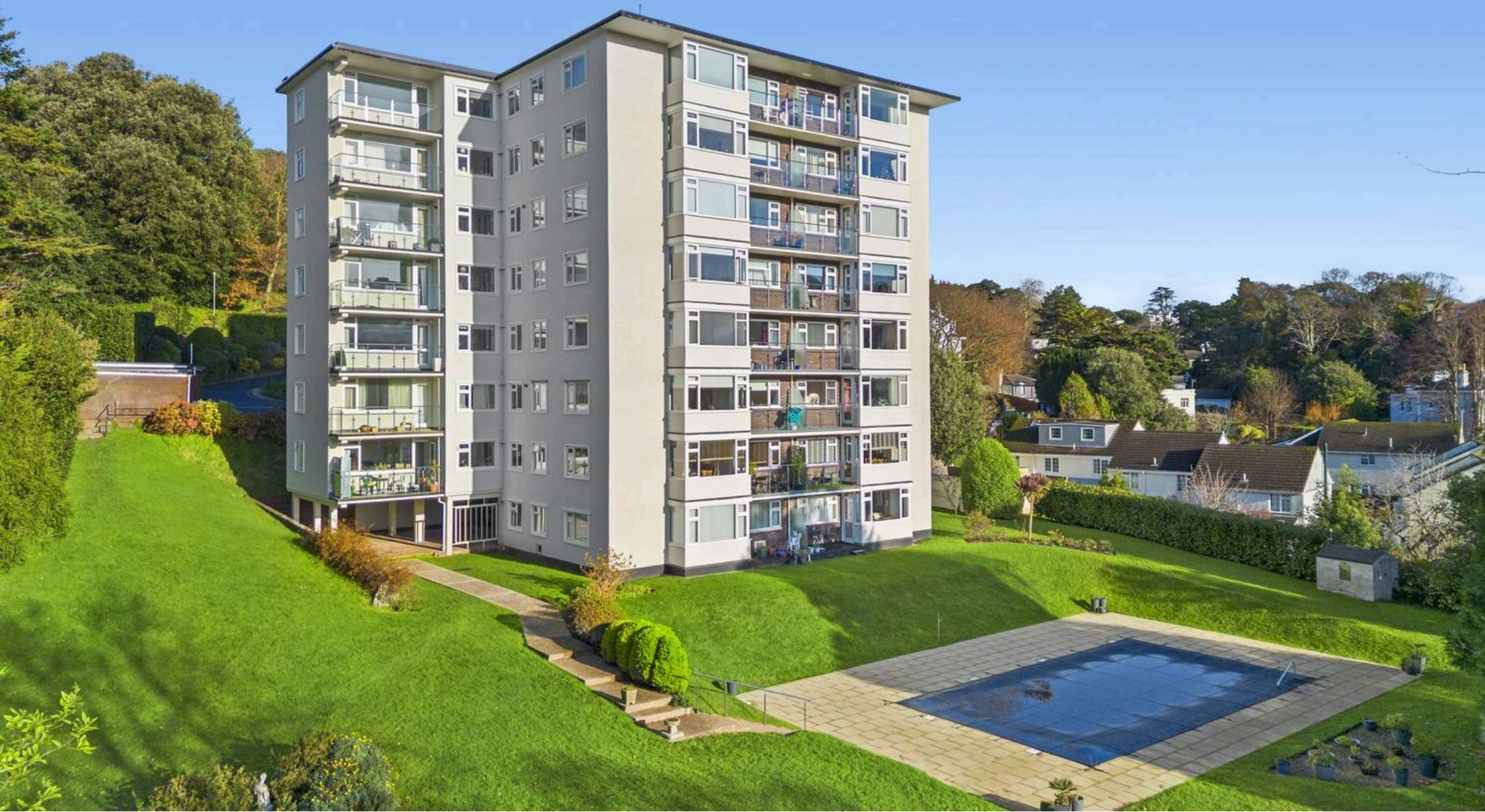
Holme Court, Lower Warberry Road, Torquay – TQ1 1QR £175,000