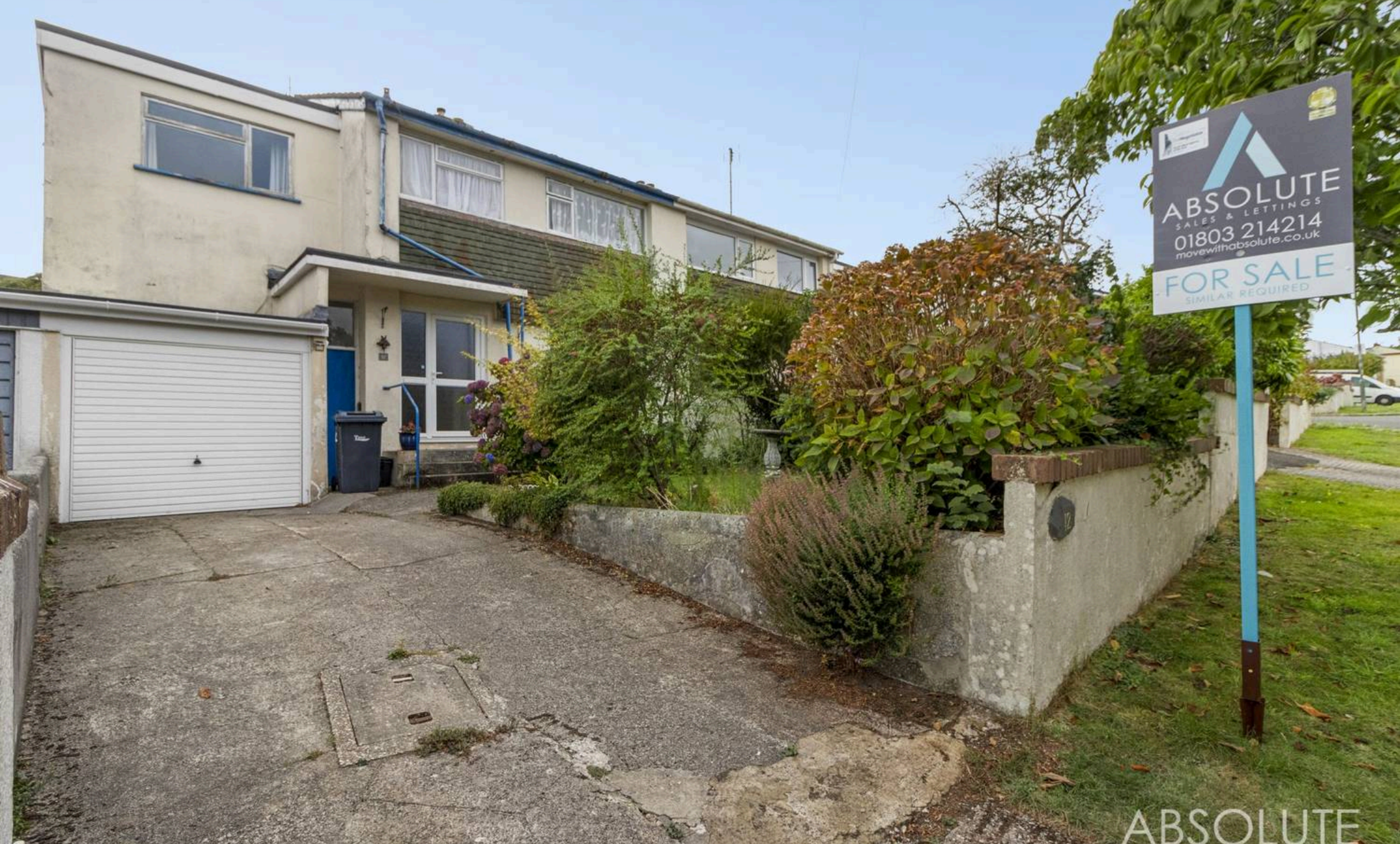
12 Courtland Road, Torquay – TQ2 6JR £295,000