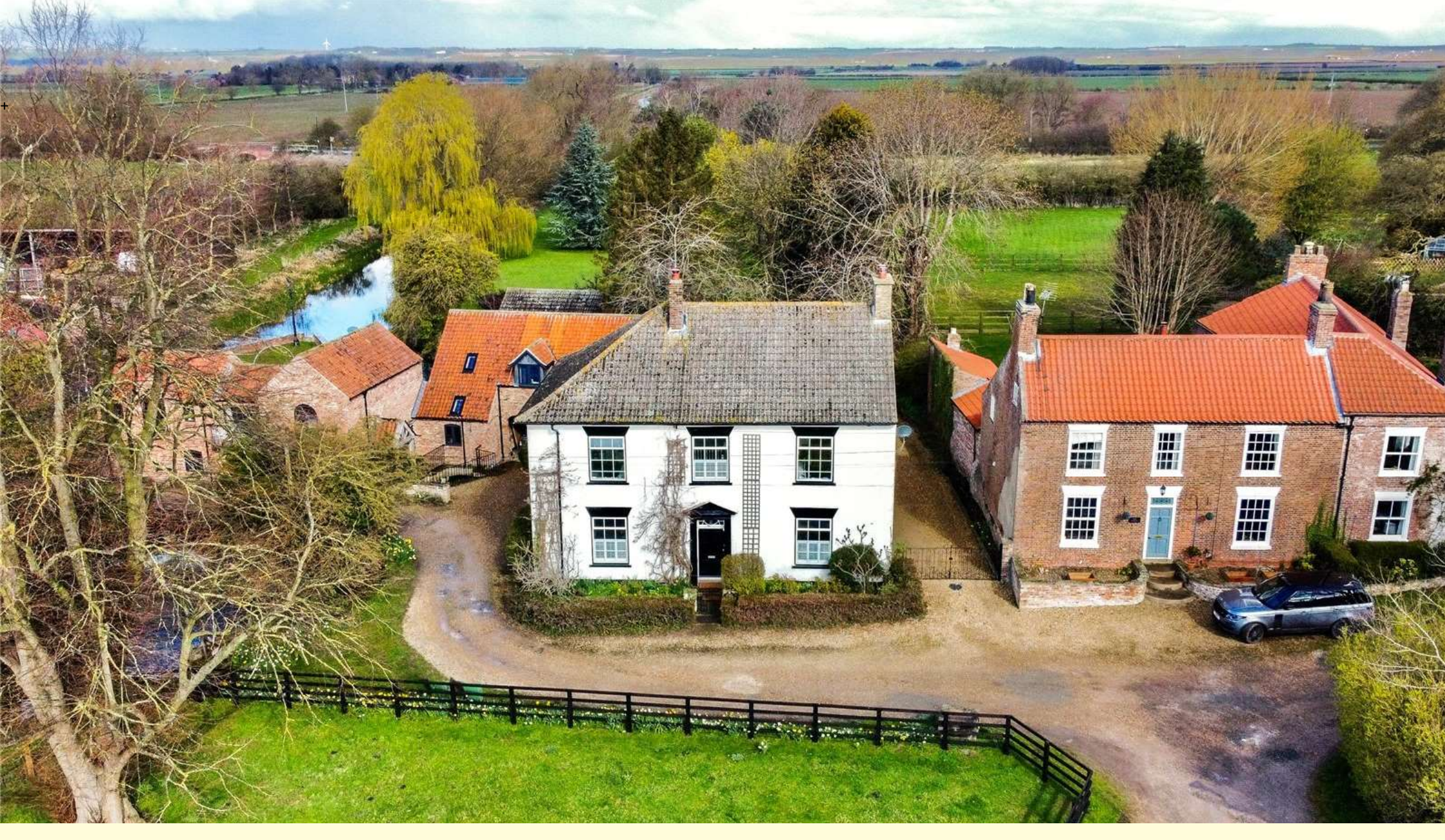
Mill Lane, Foston-on-the-Wolds, Driffield, YO25 8BP