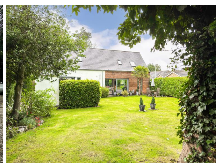
Welcome to Cedar Croft!

This exceptional property is a true masterpiece, deserving of its place on grand designs.