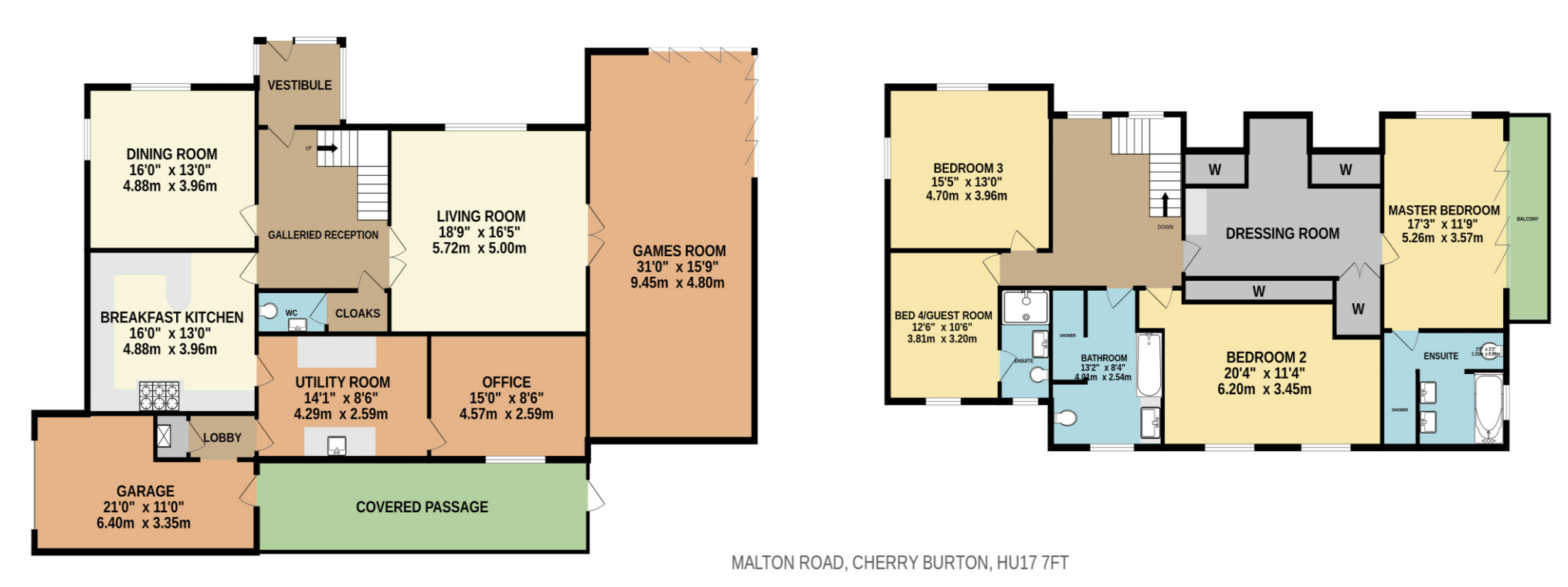
1ST FLOOR 1485 sq.ft. (138.0 sq.m.) approx.

TOTAL FLOOR AREA: 3502 sq.ft. (325.3 sq.m.) approx.