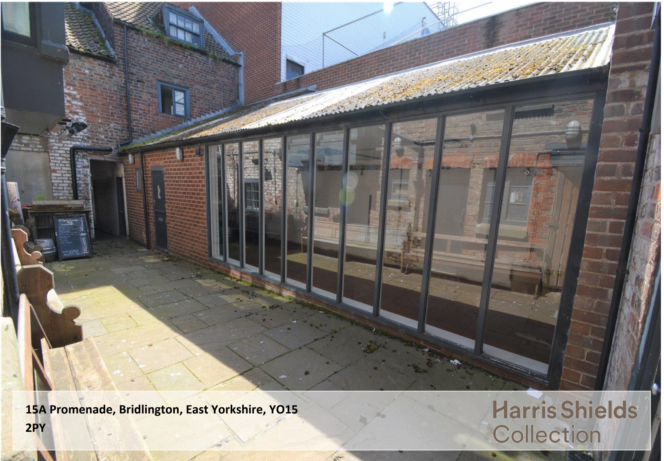
15A Promenade, Bridlington, East Yorkshire, YO15 2PY