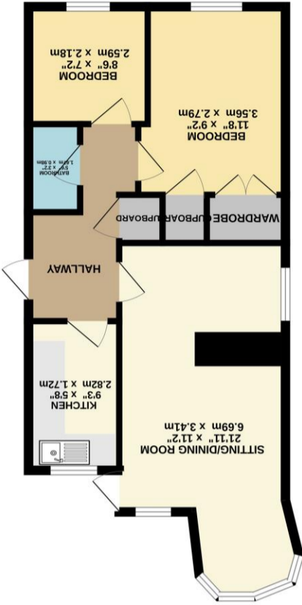
GROUND FLOOR 505 sq. ft. (47.0 sq. m.) approx.

51 ALEXANDRA COURT, BRIDLINGTON, YO15 2LB TOTAL FLOOR AREA: 505 sq. ft. (47.0 sq. m.) approx. While every attempt has been made to ensure the accuracy of the floorplan contained herein, measurements of doors, windows, rooms and any other areas are approximate and no responsibility is taken for error, omission or misstatement. This plan is for illustrative purposes only and should be used as such by any prospective purchaser. The services, systems and appliances shown have not been tested and no guarantee as to their operation or efficiency can be given. Made with Metropix 5/2025