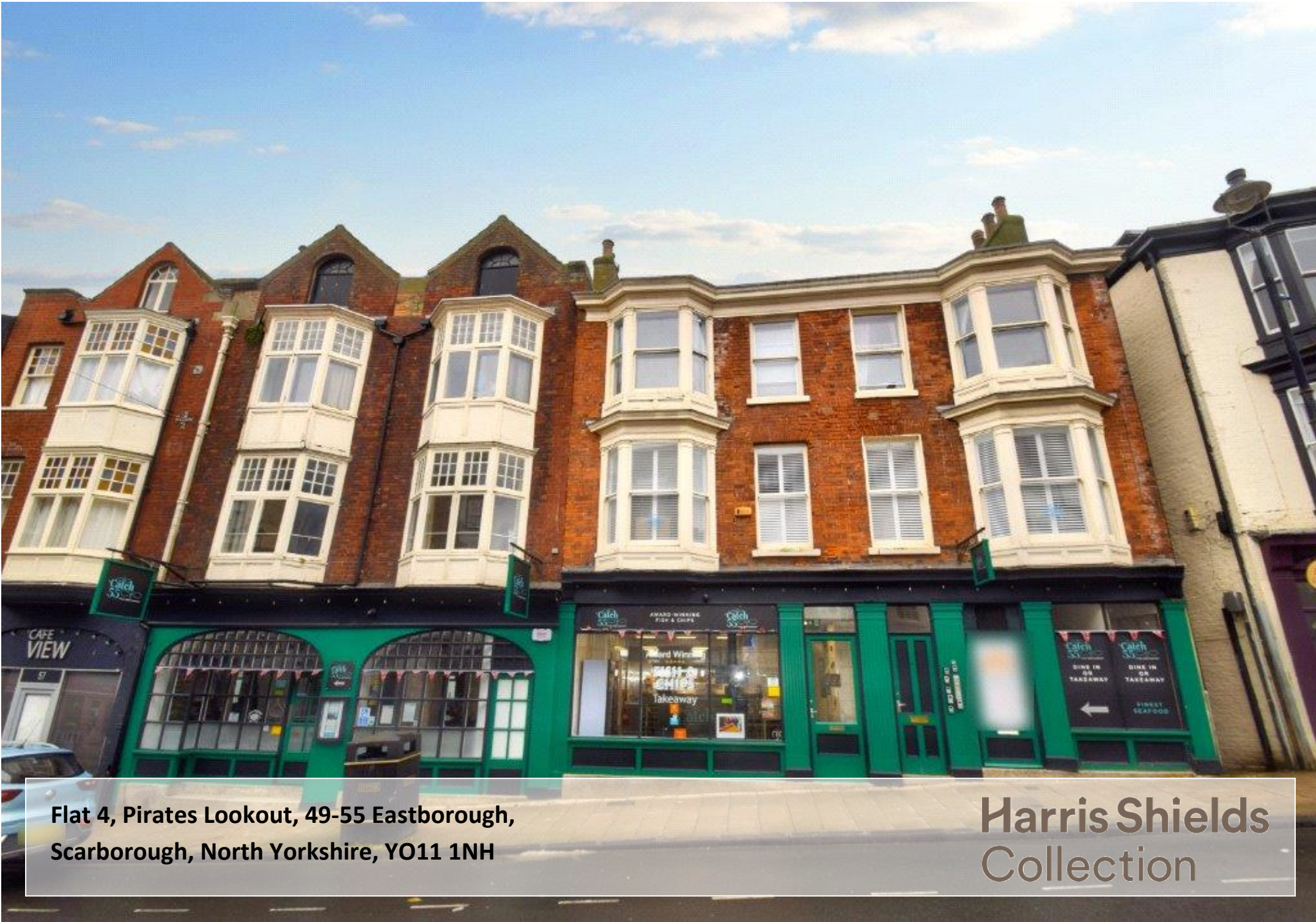
Flat 4, Pirates Lookout, 49-55 Eastborough, Scarborough, North Yorkshire, YO11 1NH