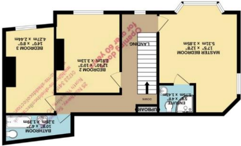
1ST FLOOR 604 sq.ft. (56.1 sq.m.) approx.