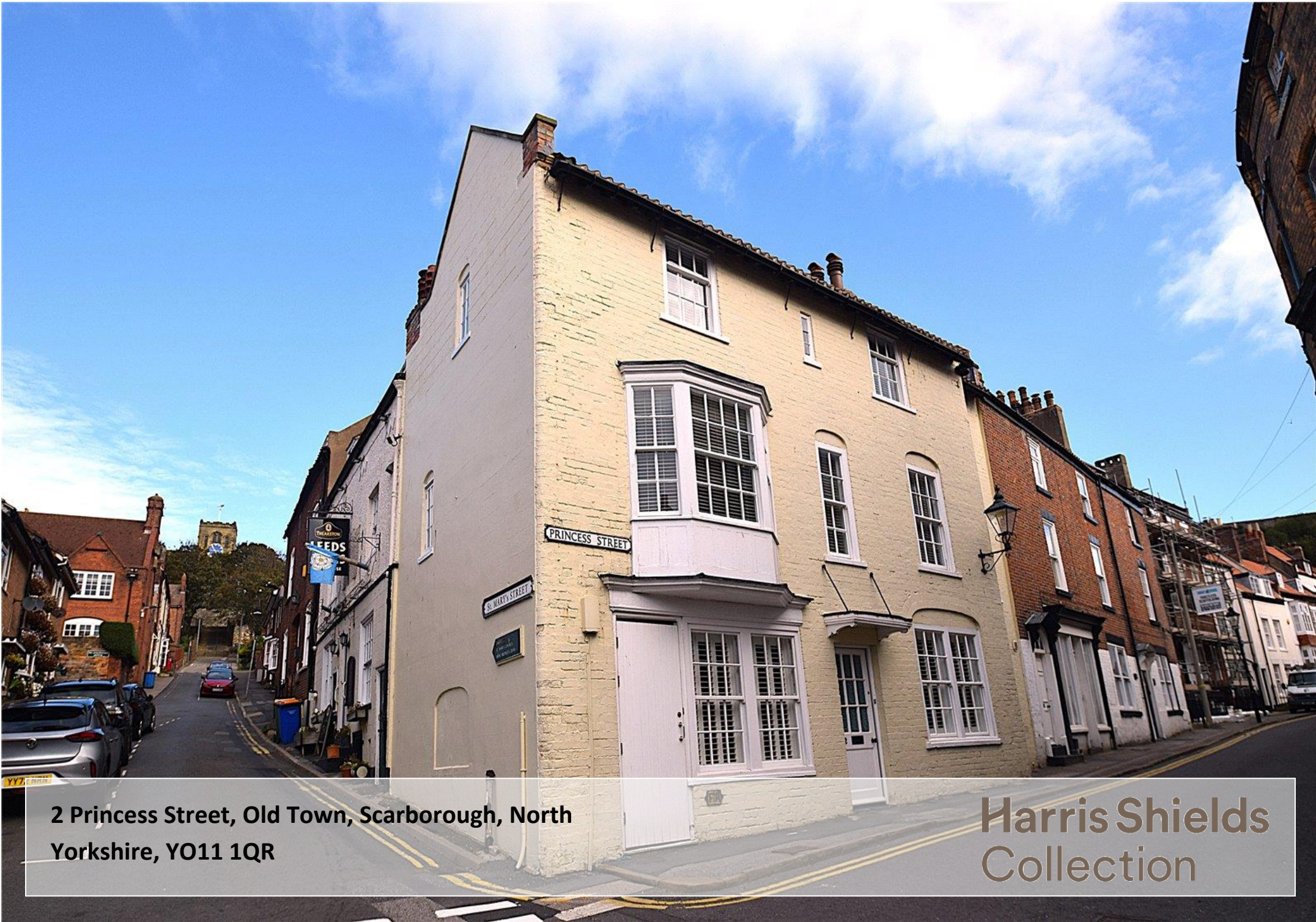
2 Princess Street, Old Town, Scarborough, North Yorkshire, YO11 1QR