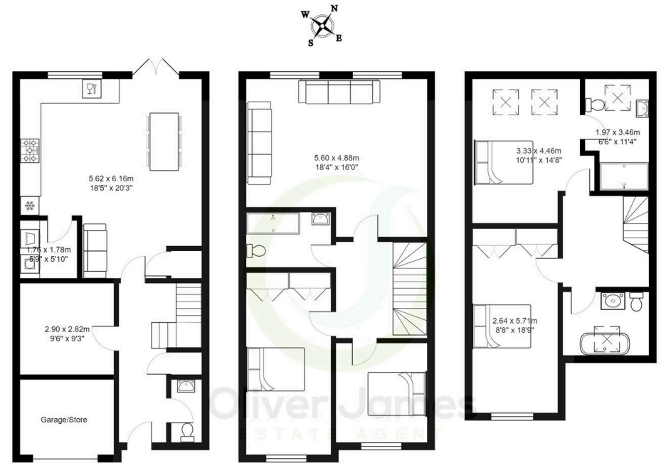
Total Area: 179.6 m 2 ... 1933 ft 2 All measurements are approximate and for display purposes only