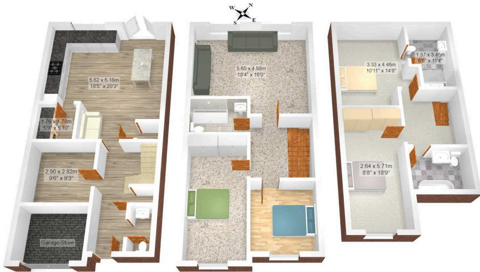
Total Area: 179.6 m 2 ... 1933 ft 2 All measurements are approximate and for display purposes only