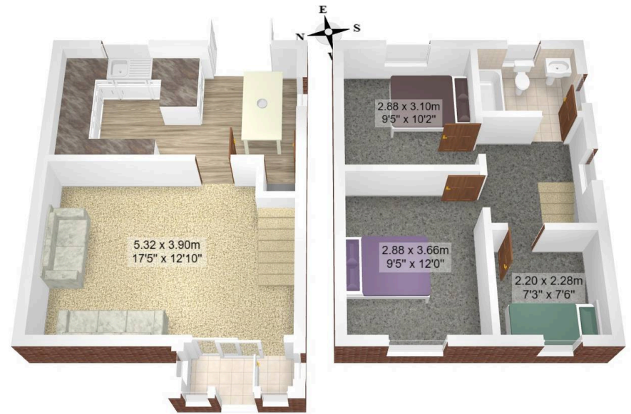
Total Area: 74.1 m 2 ... 797 ft 2 All measurements are approximate and for display purposes only