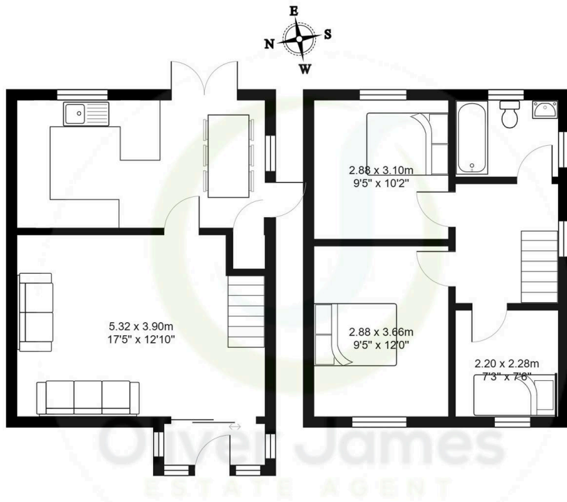
Total Area: 74.1 m 2 ... 797 ft 2 All measurements are approximate and for display purposes only