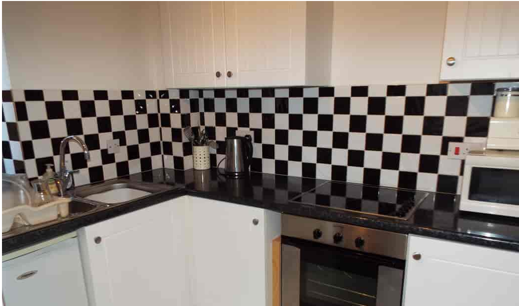
Flat 1, 26a Britannia Road, Banbury. OX16 5DS Guide Price £128,000 - Leasehold