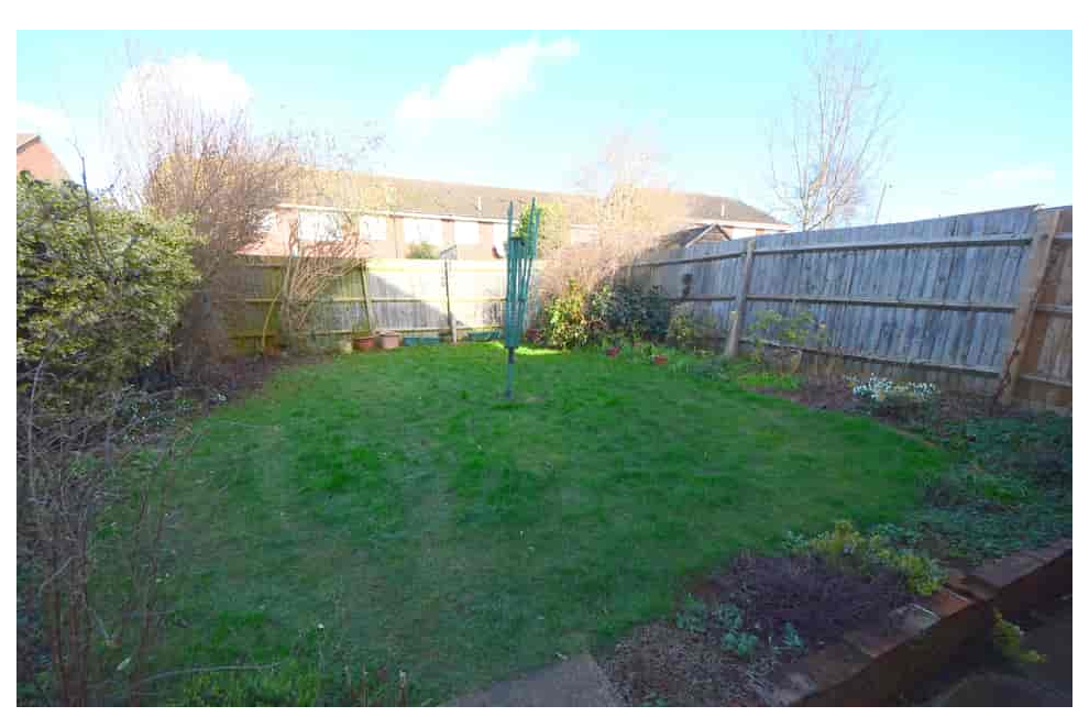
7 Romney Road, Banbury, Oxfordshire. OX16 1YA Guide Price £365,000 - Freehold