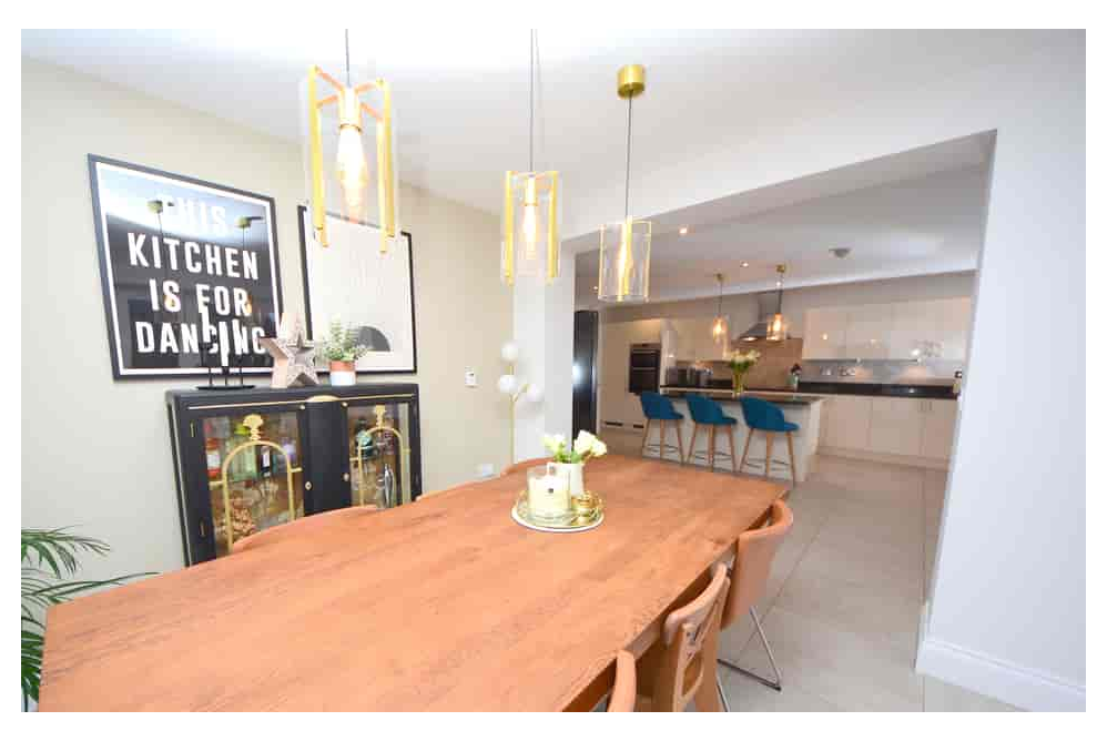
5 Buckingham Close, Kings Sutton, Northamptonshire. OX17 3FT Offers Over £700,000 - Freehold