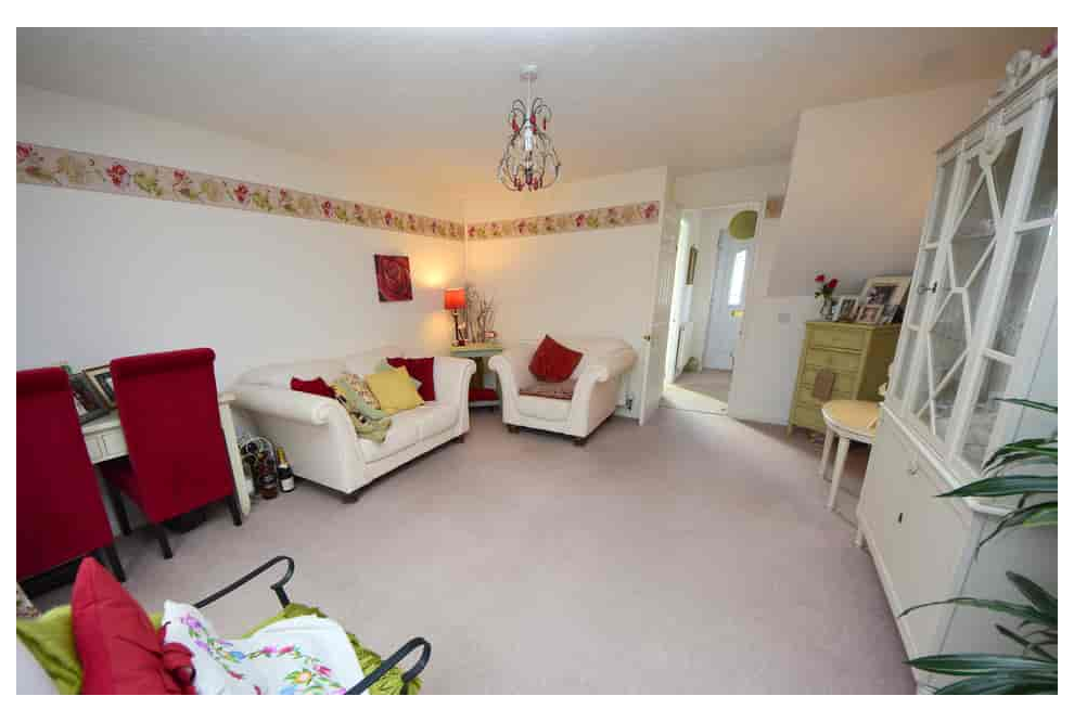
63 Waltham Gardens, Banbury, Oxfordshire. OX16 4FB Guide Price £247,500 - Freehold