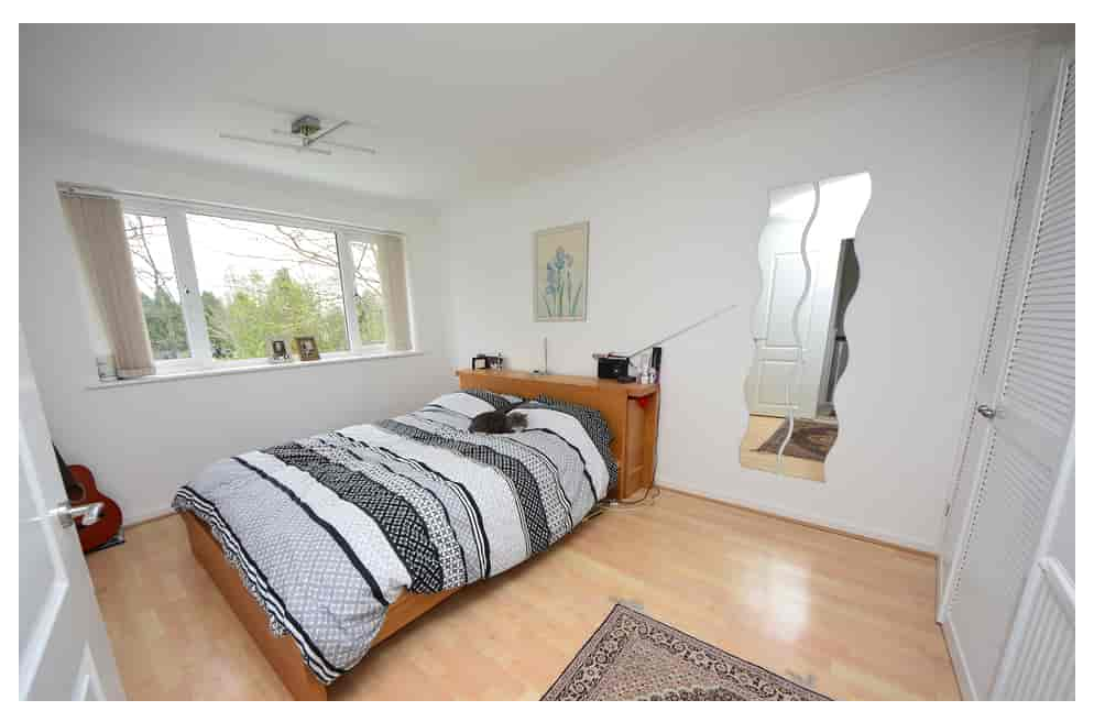
11 Garden Close, Banbury, Oxfordshire. OX16 2NB Guide Price £290,000 - Freehold