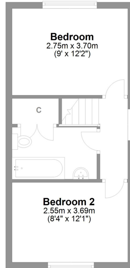
First Floor Approx. 29.9 sq. metres (321.5 sq. feet)