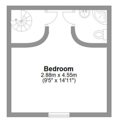
First Floor Approx. 19.5 sq. metres (209.7 sq. feet)

Total area: approx. 134.5 sq. metres (1447.9 sq. feet)