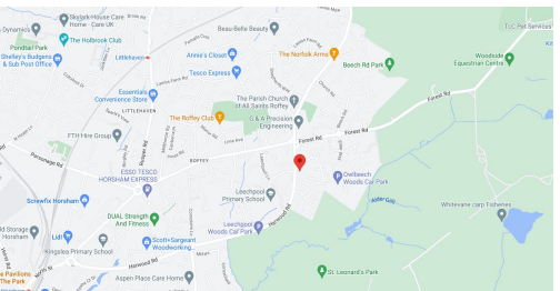
England & Wales