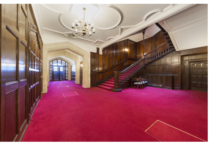
Forest Road Colgate, RH12 4TD