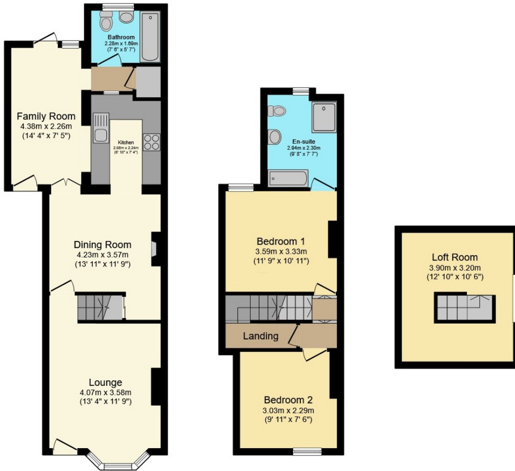
Ground Floor First Floor Second Floor