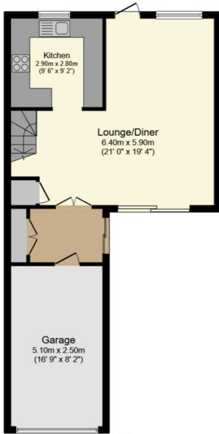
Ground Floor Floor area 57.9 m 2 (624 sq.ft.)