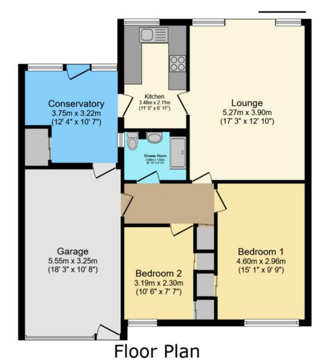
Floor area 90.2 m<sup>2</sup> (971 sq.ft.)