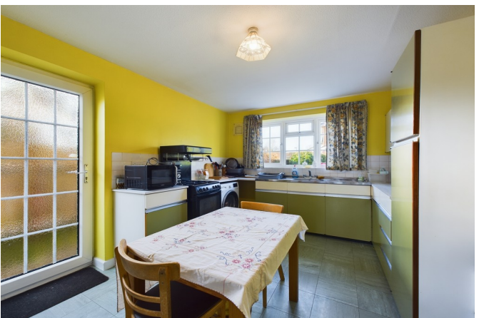
Dickins Way Horsham, RH13 6BQ