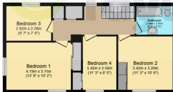
First Floor Floor area 58.4 sq.m. (628 sq.ft.)