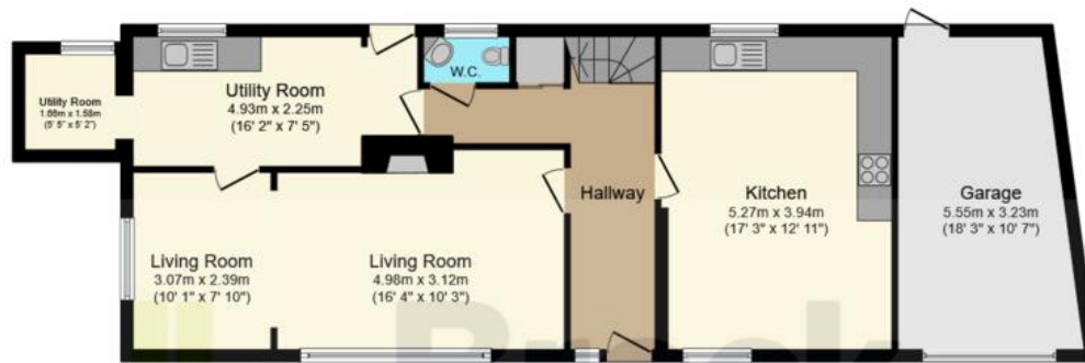
Ground Floor Floor area 90.4 sq.m. (973 sq.ft.)