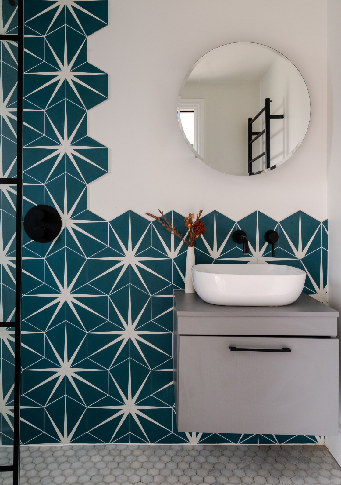
Primary bedroom en-suite