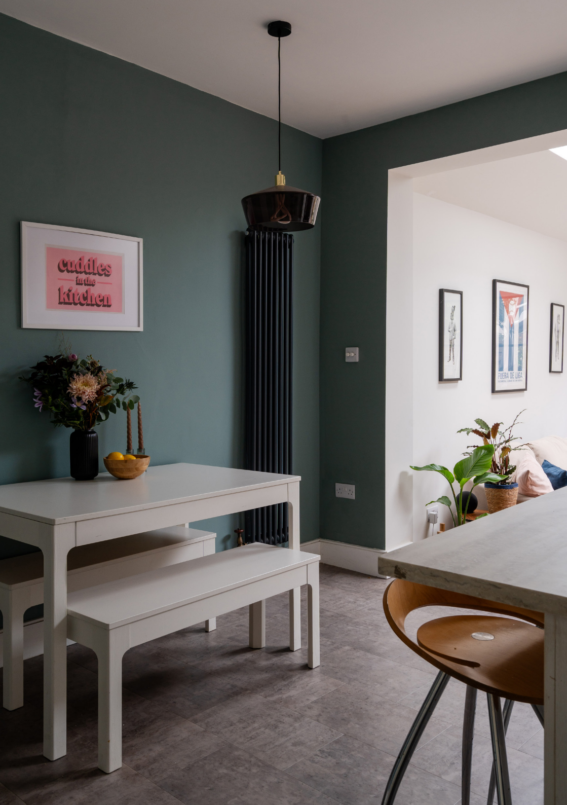
Open-concept living/dining kitchen