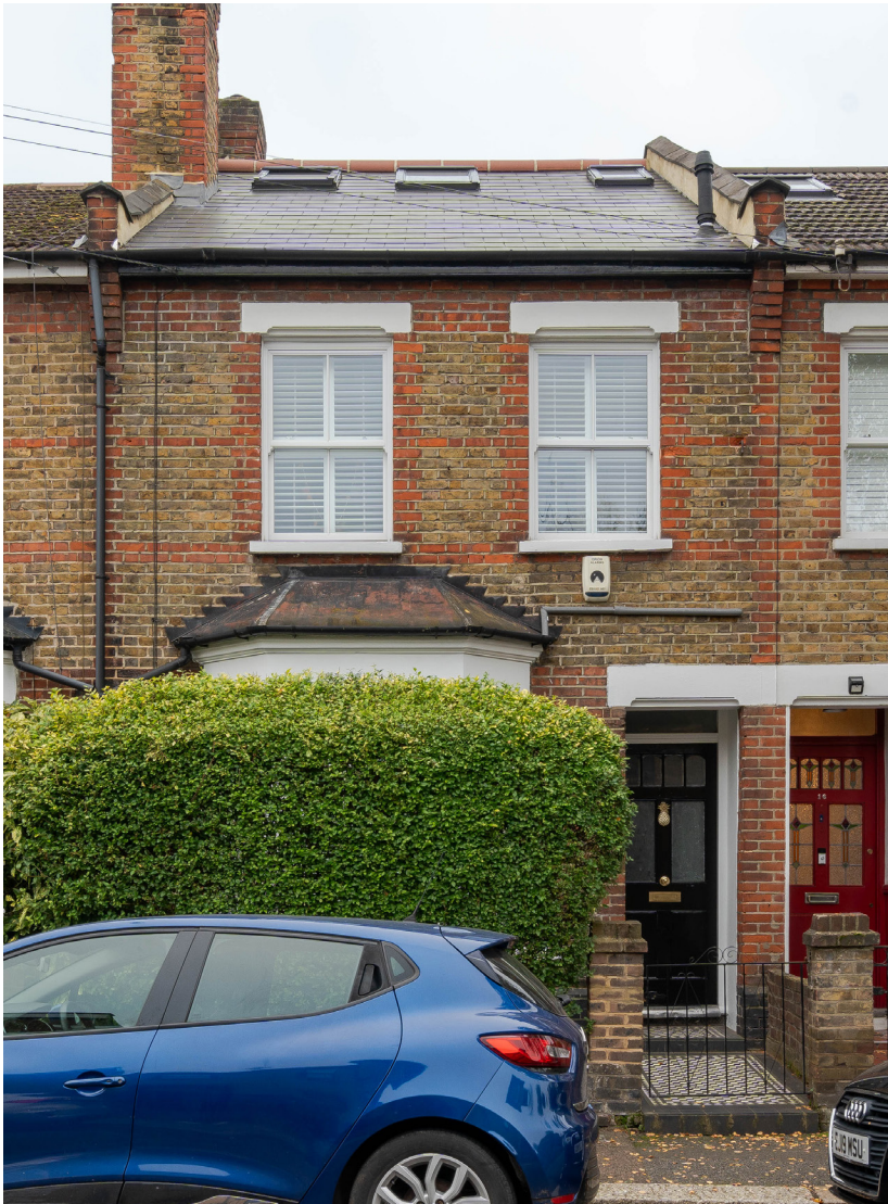
Front of house