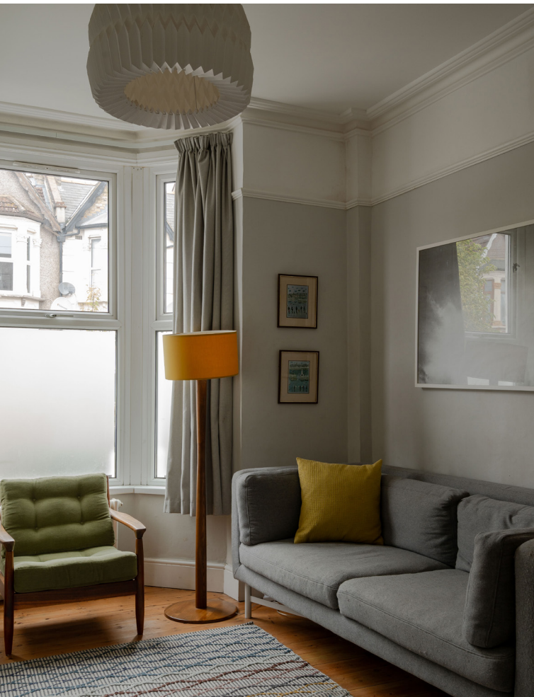
Double reception room