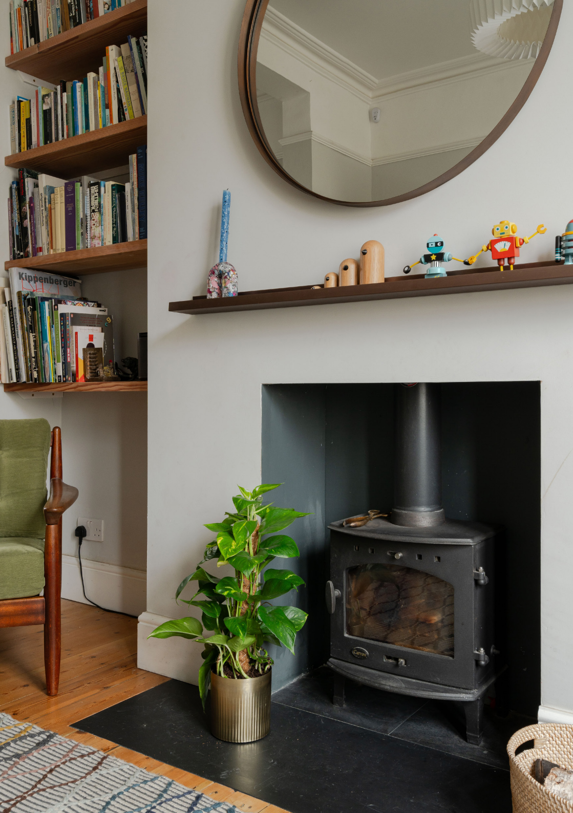
Double reception room