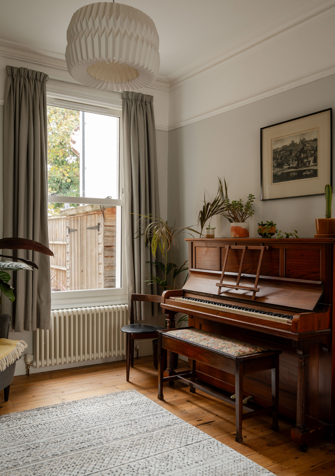
Double reception room