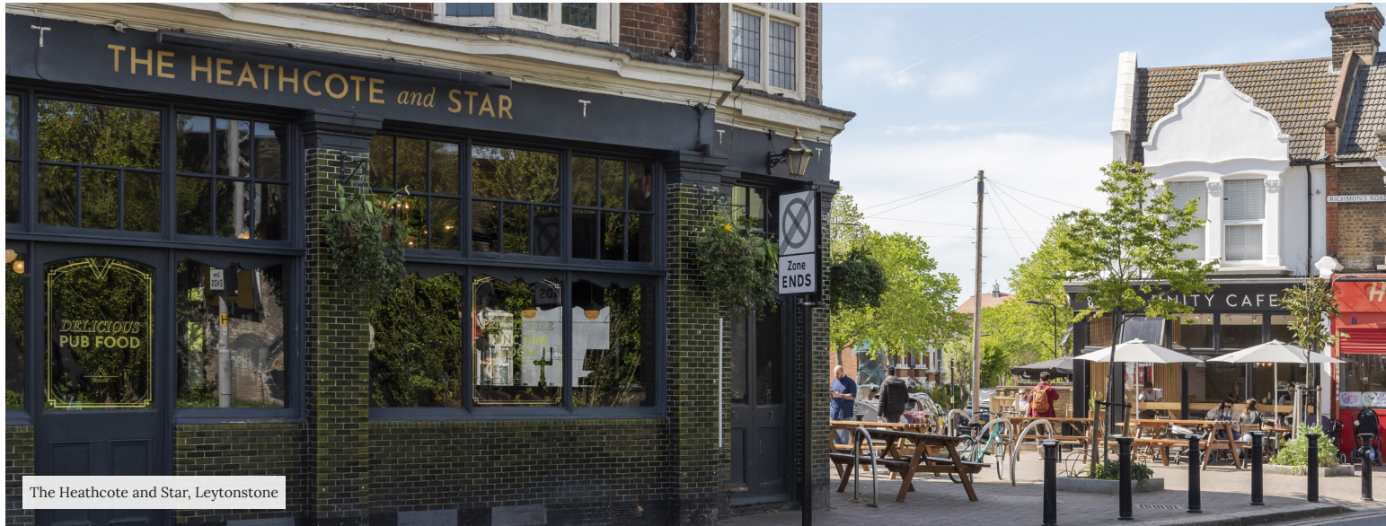
The Heathcote and Star, Leytonstone

Just around the corner from several great neighbourhood watering holes – the Heathcote & Star pub, the Filly Brook eatery, and the Burnt smokehouse – Southwest Road is equally suited for a wander into the bustle of High Road Leytonstone or down to Leyton Village on Francis Road.