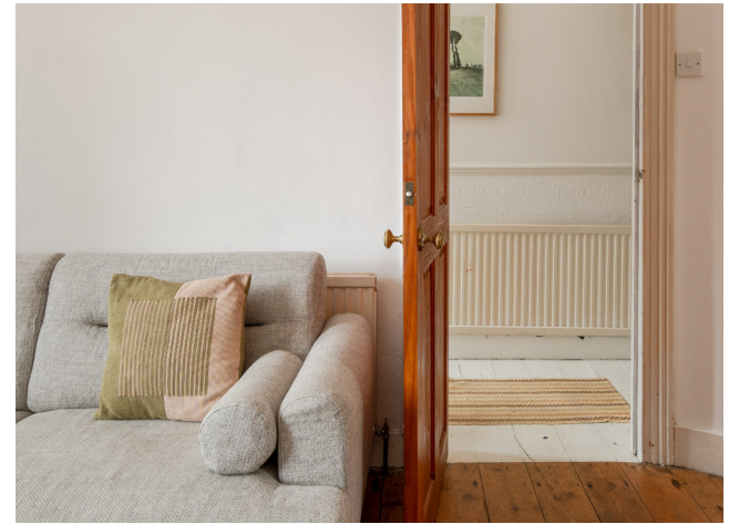
DOUBLE RECEPTION - LIVING AREA