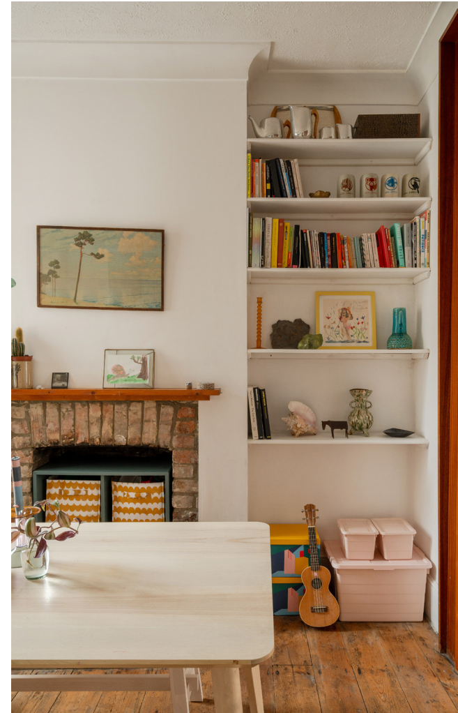
DOUBLE RECEPTION - DINING AREA