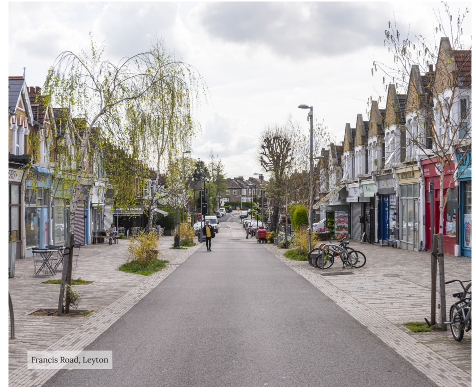
Francis Road, Leyton

Alternatively, hop onto the A12 and head down to Stratford for shopping or to enjoy sporting events and concerts at the London Stadium; continue to Canary Wharf; or take the A11 into the heart of the City.