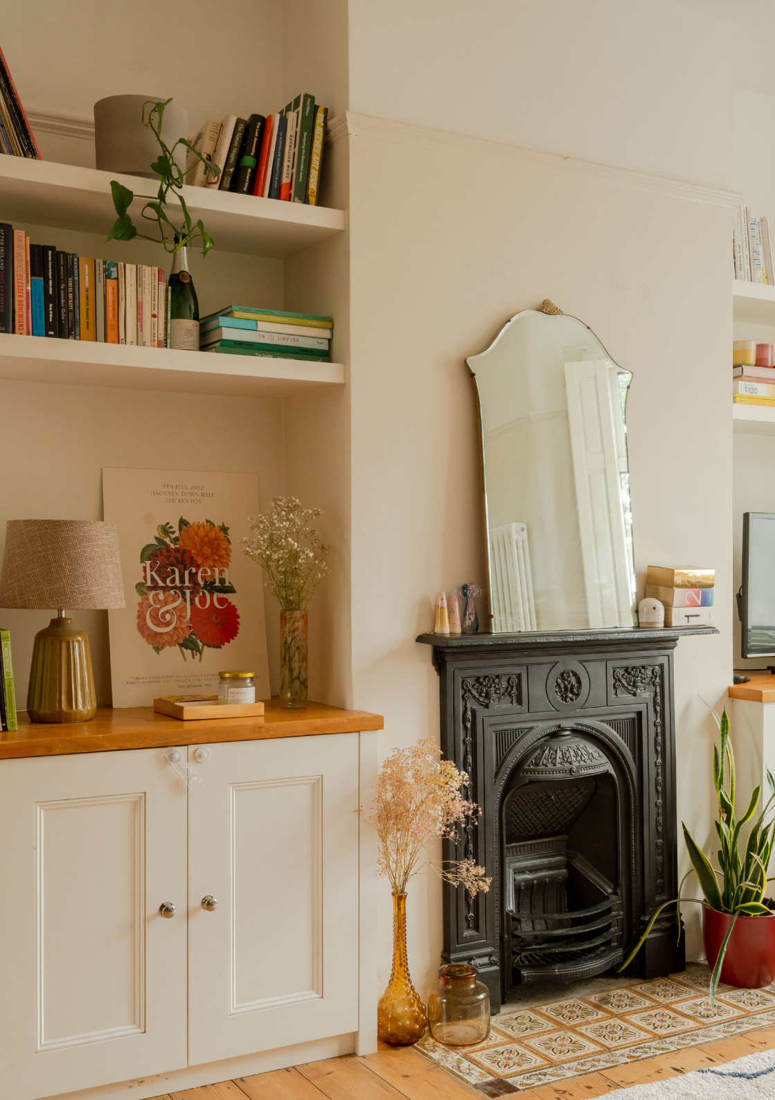
Double reception room