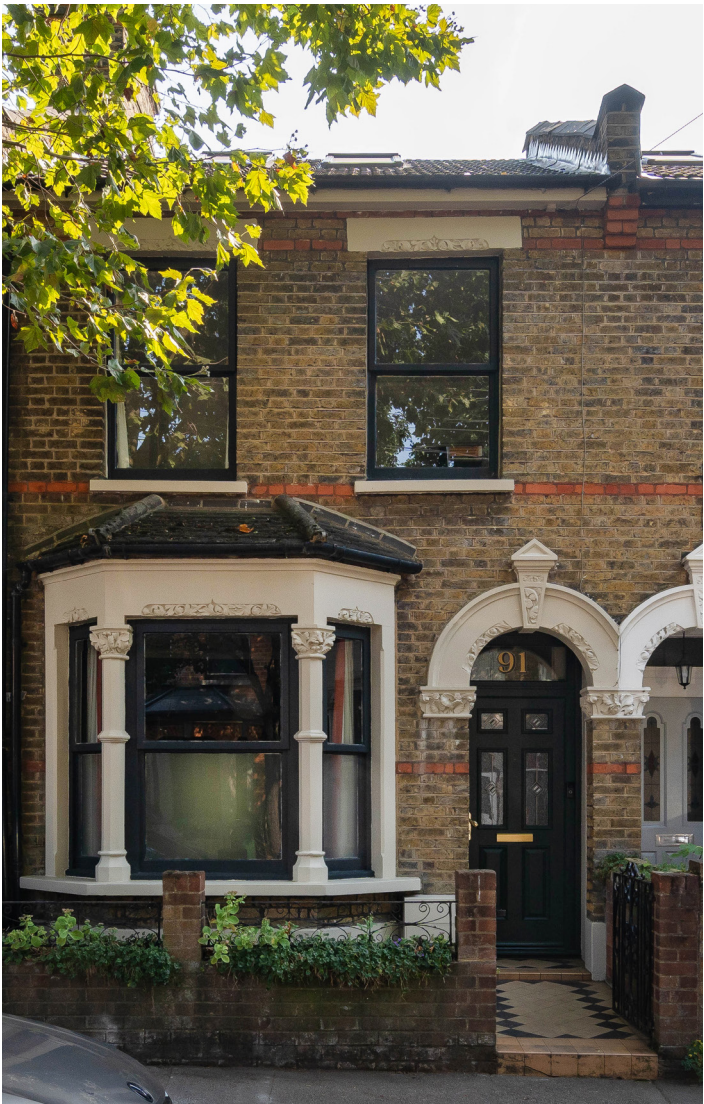
Front of house