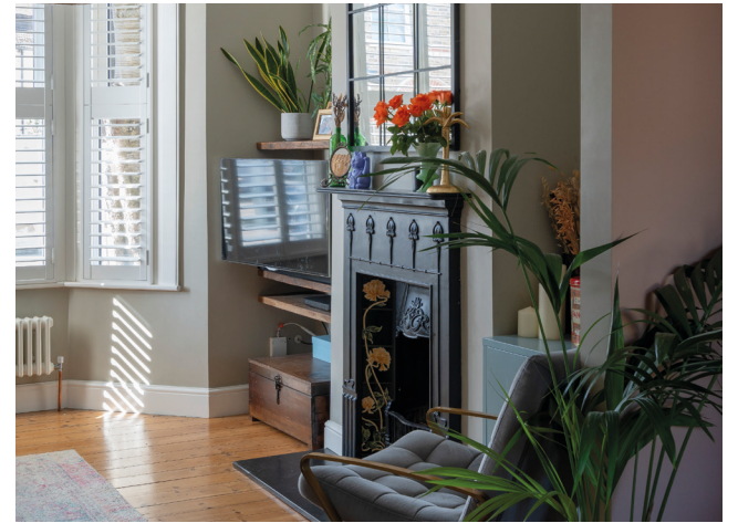
DOUBLE RECEPTION - LIVING AREA