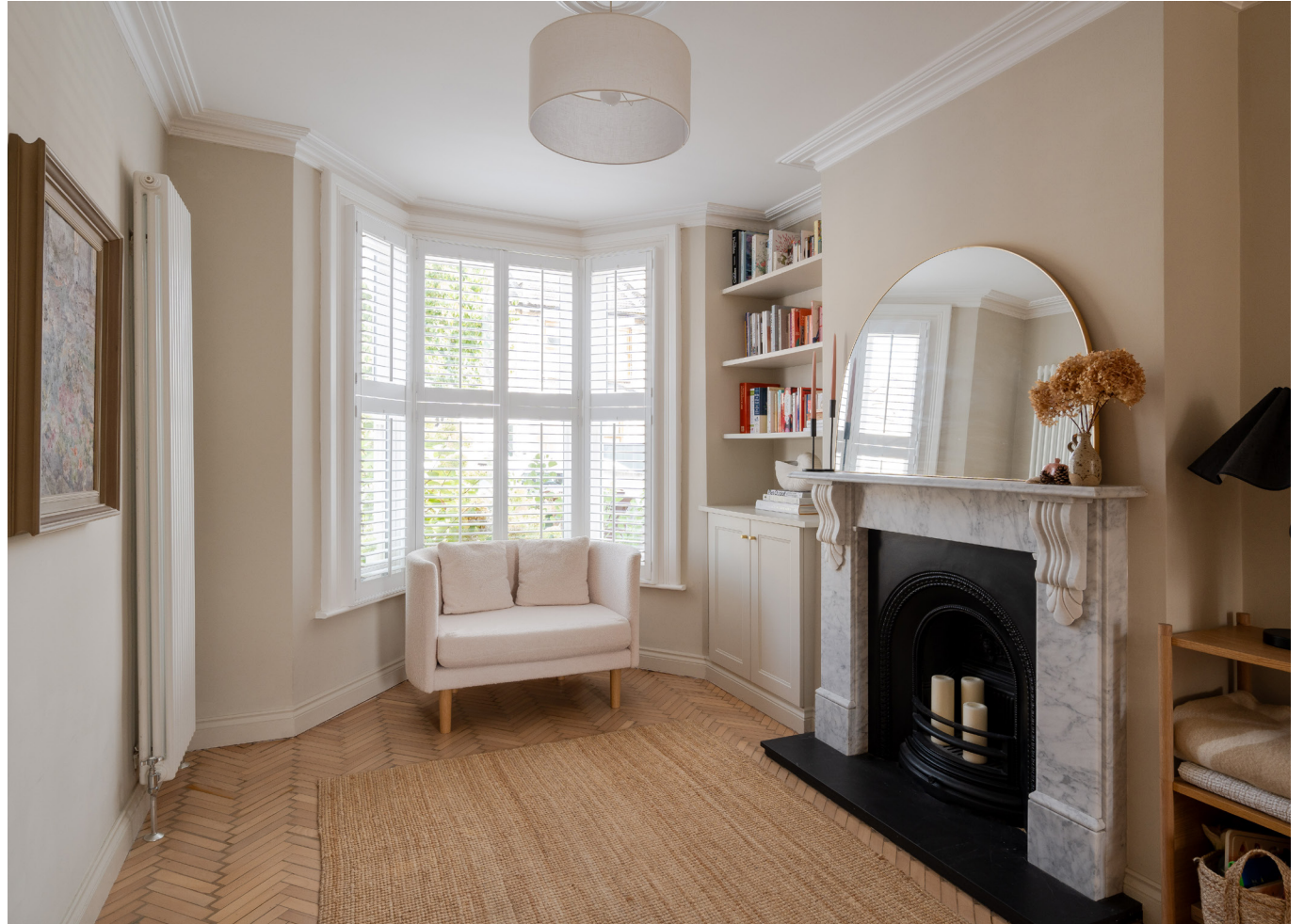
DOUBLE RECEPTION - FRONT SECTION