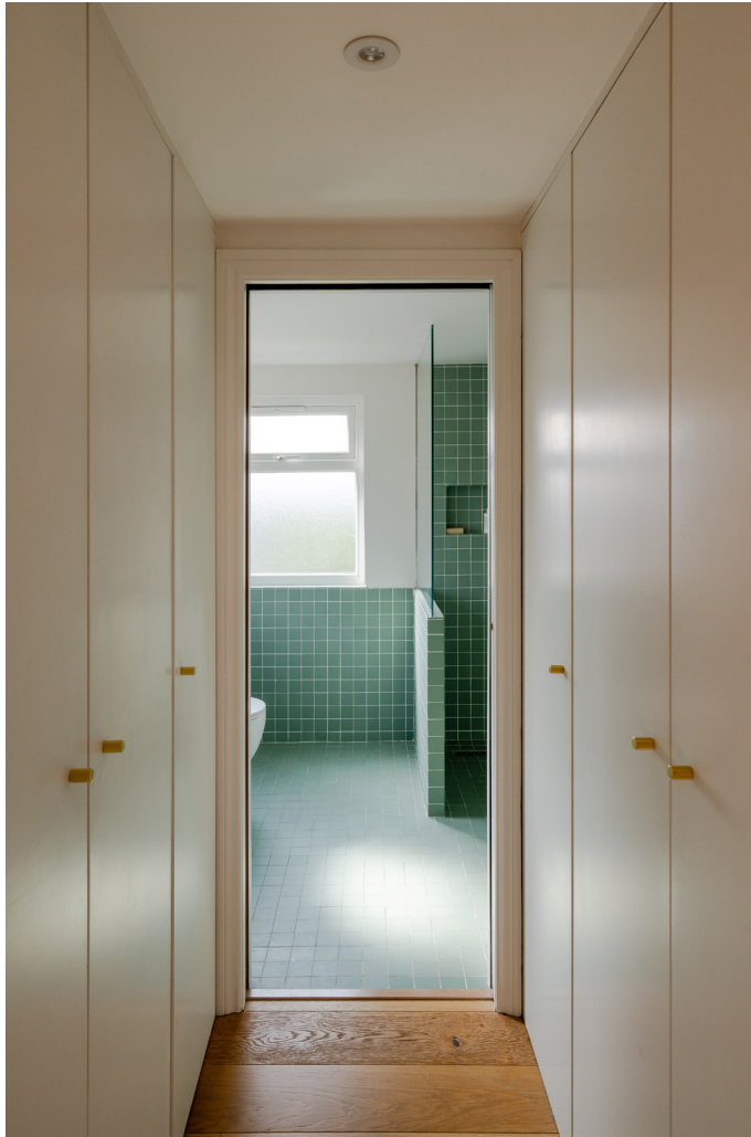
PRIMARY BEDROOM WALK-THROUGH WARDOBE