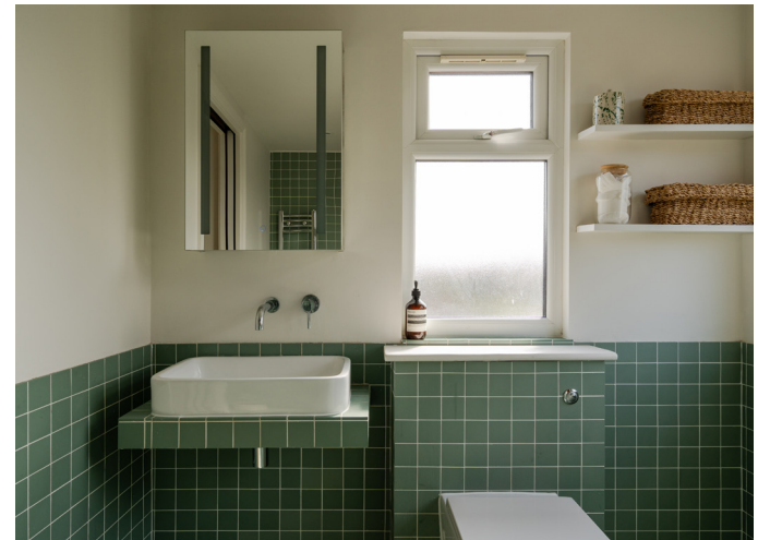
PRIMARY BEDROOM ENSUITE