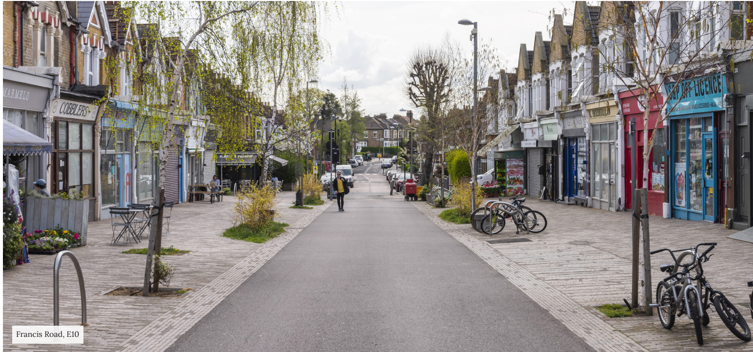
Francis Road, E10