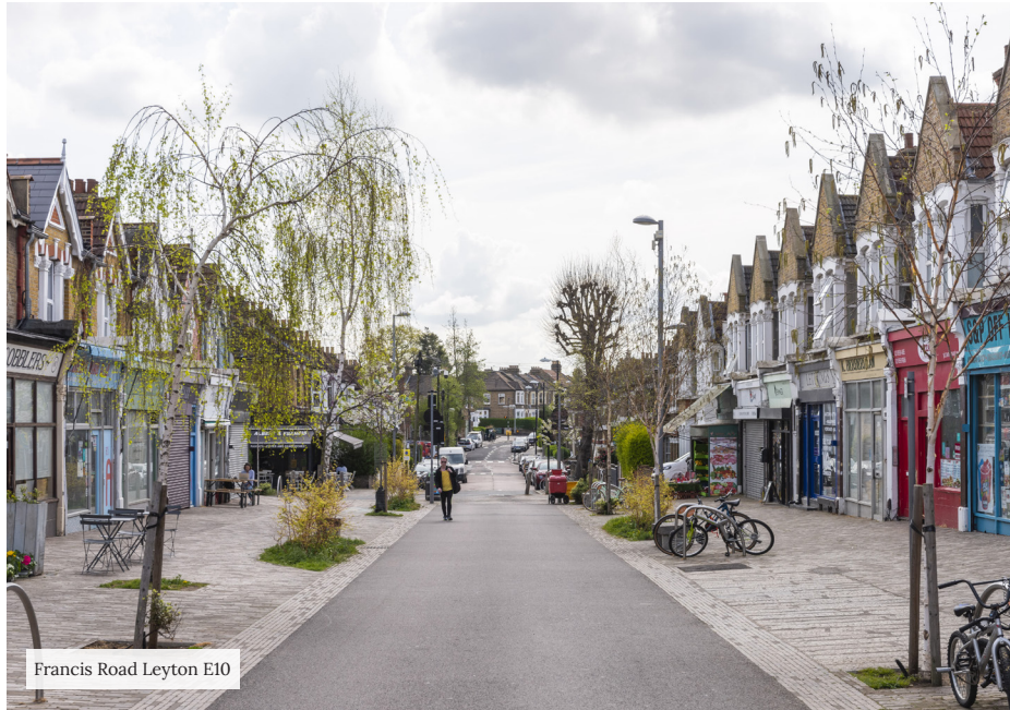
Francis Road Leyton E10

Frith Road is conveniently located just minutes from the many shops, eateries, and amenities of High Road Leyton and just five minutes' walk from Leyton Underground, which runs Central line services into the City and West End, Canary Wharf, and South Bank via the Jubilee line from Stratford. Just one stop away, Stratford hosts the beautiful Queen Elizabeth Park and serious retail therapy at Westfield.