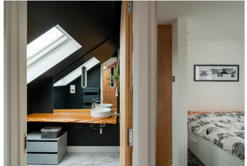
ENSUITE TO FOURTH BEDROOM