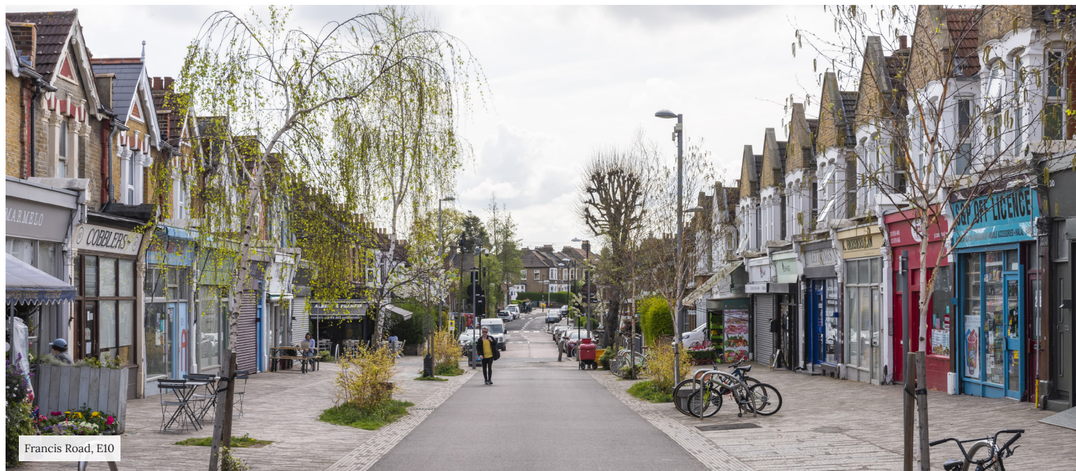
Francis Road, E10

Leslie Road sits in a convenient spot just minutes from the many shops, eateries and amenities of High Road Leyton, and just eight minutes' walk from Leyton Underground, which runs Central line services into the City, the West End, Canary Wharf, and South Bank. Just one stop away, Stratford hosts the beautiful Queen Elizabeth Park and serious retail therapy at Westfield.