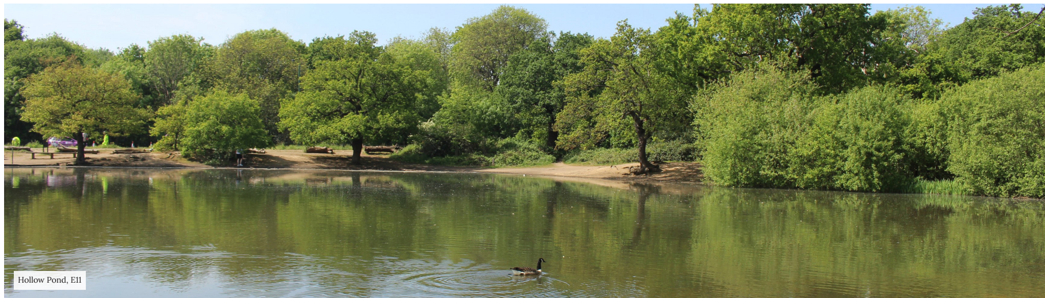
Hollow Pond, E11