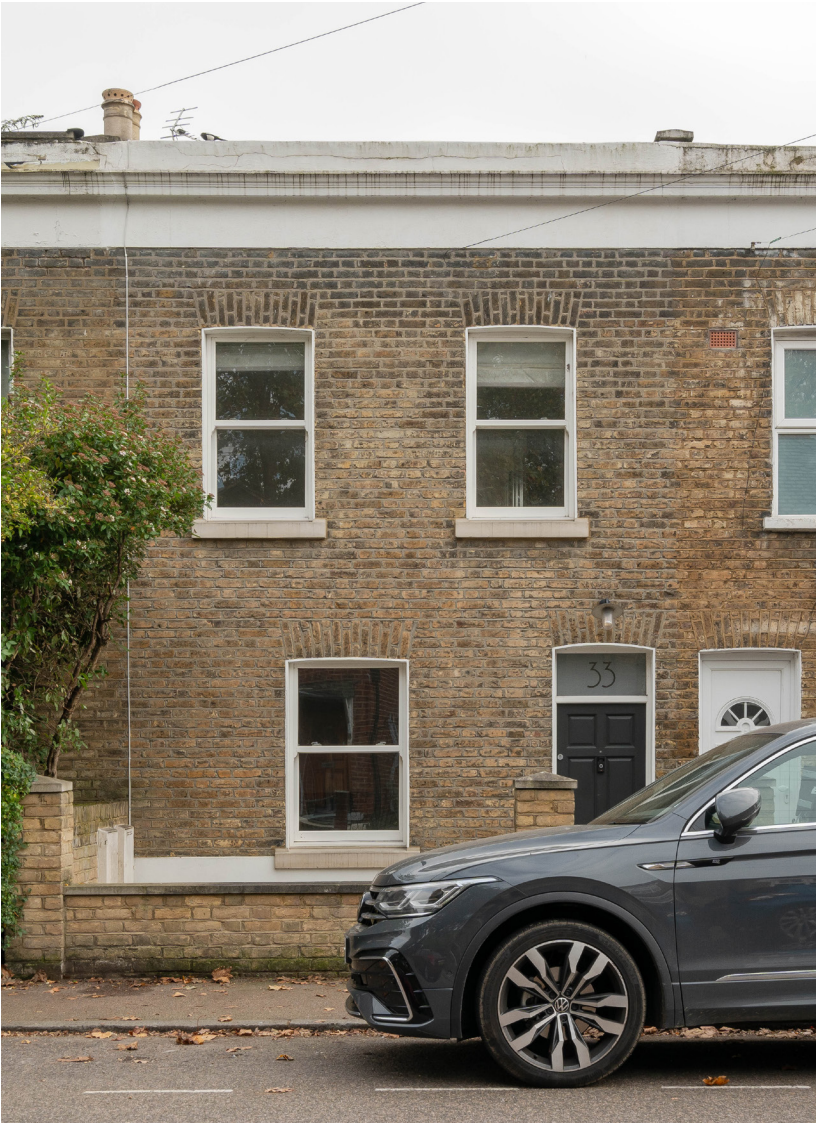
Front of house