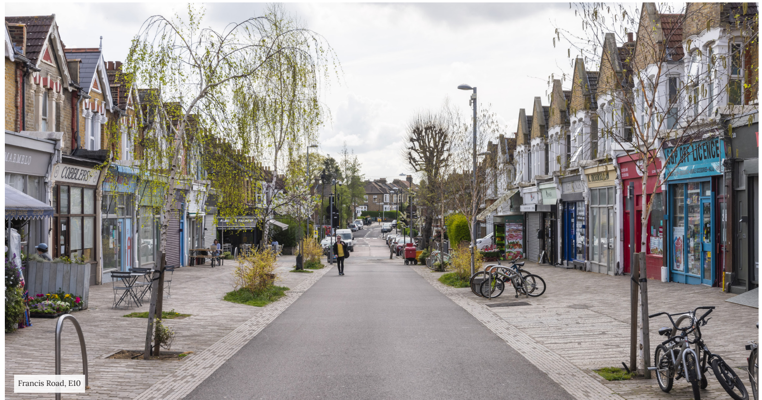
Francis Road, E10

and Secondary (rated 'Good') is also just three minutes' on foot. Meanwhile, Excel Kids Day Nursery, Barclay Primary School ('Outstanding') and Leyton Sixth Form ('Good') are all reachable on foot in under 20 minutes.