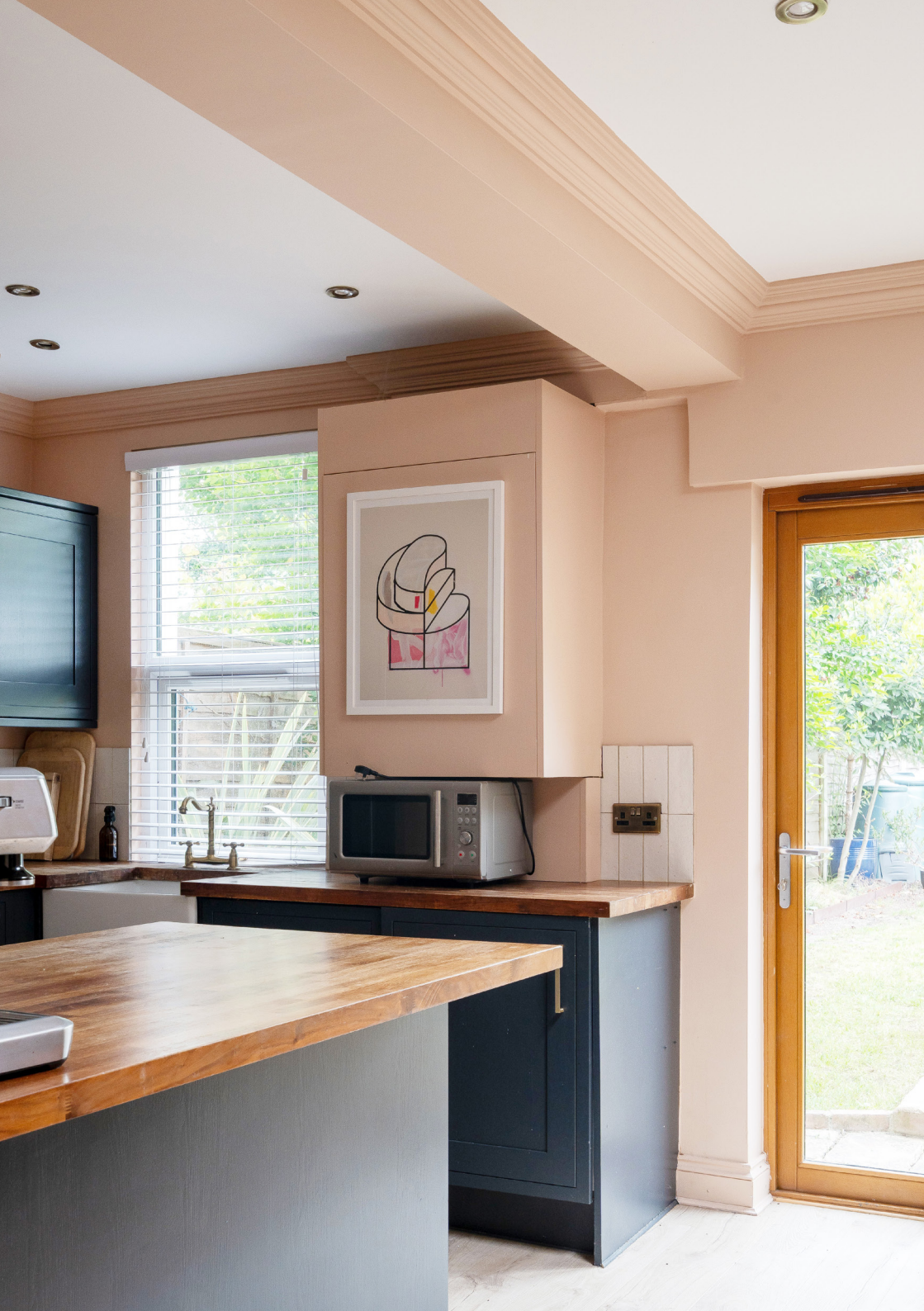
Kitchen / dining room