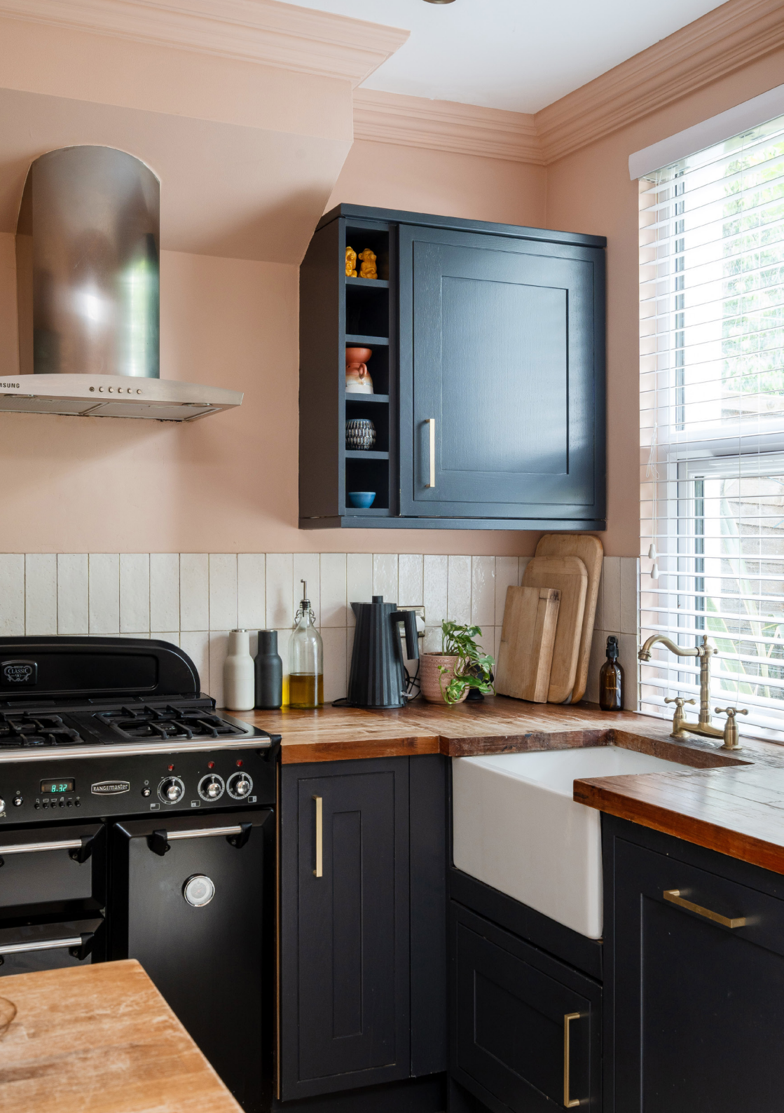
Kitchen / dining room