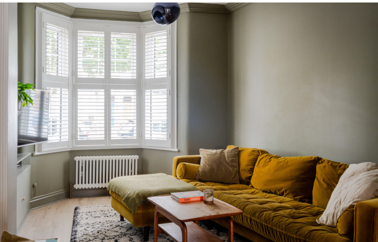
Double reception room