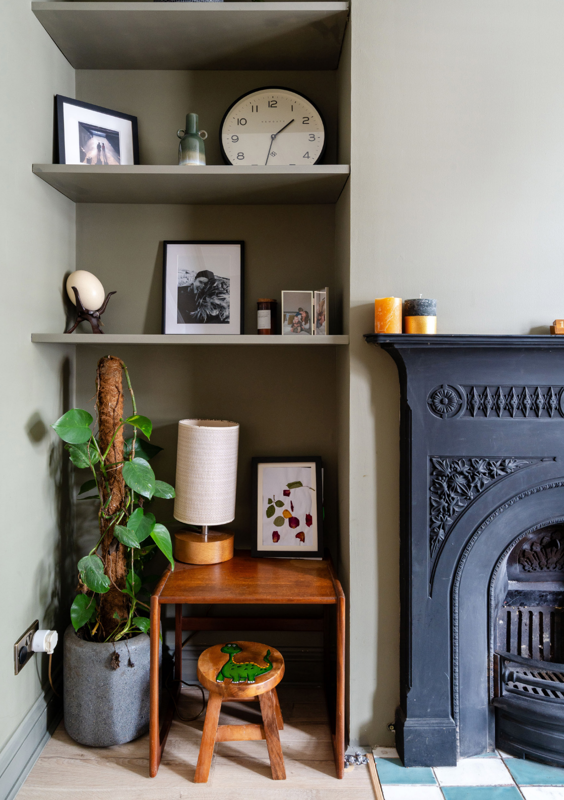
Double reception room