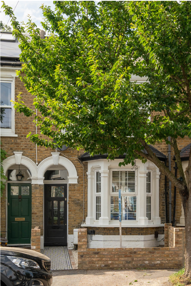
Front of house