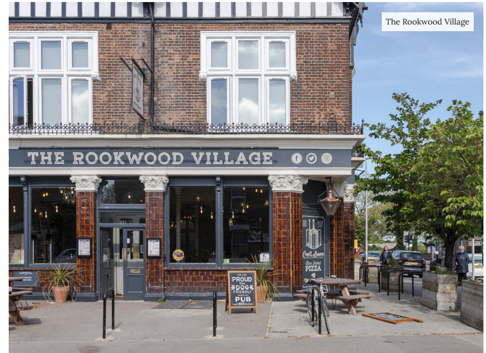
The Rookwood Village

The High Road is only a few minutes' walk away and has many cafés and convenience stores at its southern end. If you like traditional Neapolitan pizza, check out Bocca Bocca or Yard Sale. Other local favourites include Sunday roasts at the Holly Tree pub, Singburi for famously good