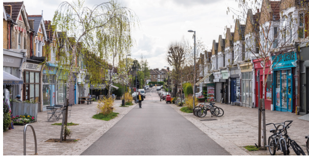
Francis Road, Leyton

Heading into the neighbourhood, the local lifestyle is varied and full. The wonderful village scene on Francis Road is just a few minutes' walk away with shops, bars and delis including Marmelo Kitchen for coffee and fresh bread, Morny bakery for an amazing selection of sweet and savoury treats, Yardarm for lunch or dinner and the fantastic wine shop, Phlox bookstore, Edie Rose florist and Pause yoga studio. Four great pubs - The Northcote, Leyton Technical, Heathcote & Star and The Fillybrook - and High Road Leytonstone's pubs and cafés are all within a short wander.