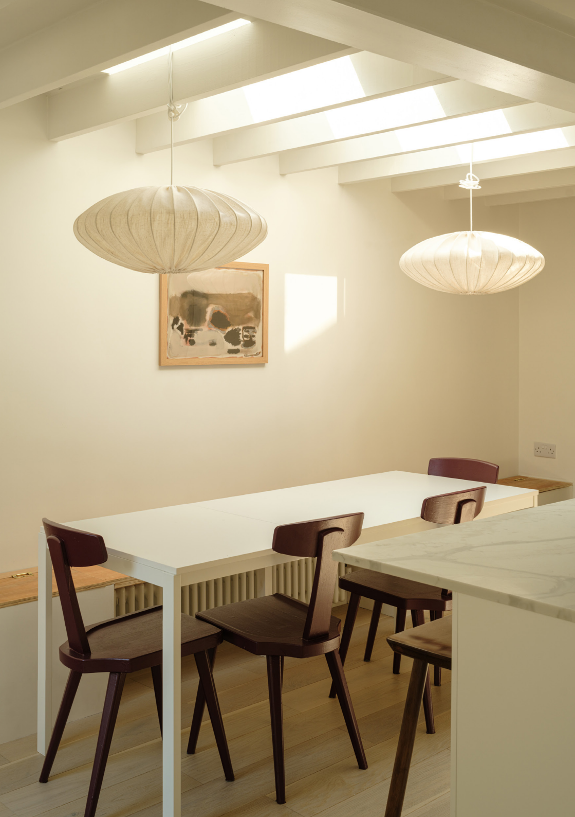
Kitchen / dining room