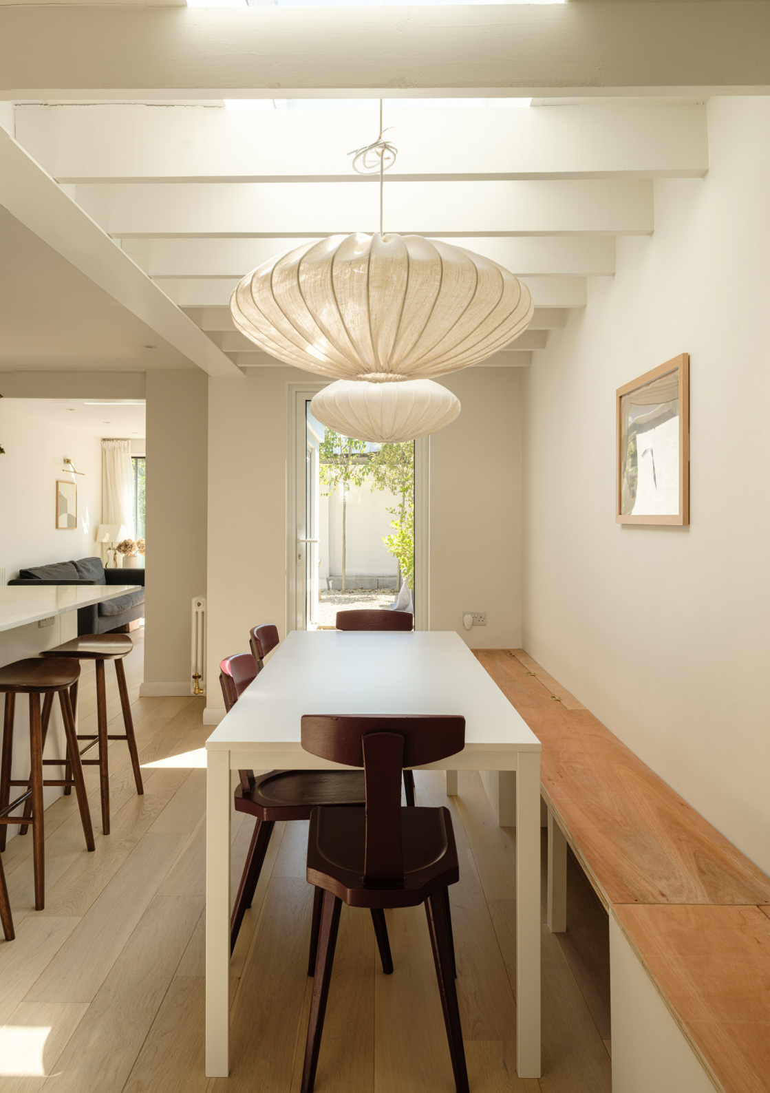
Kitchen / dining room