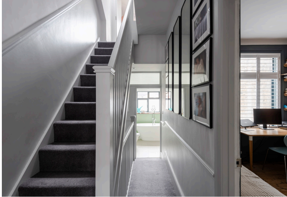
STAIRS TO SECOND FLOOR