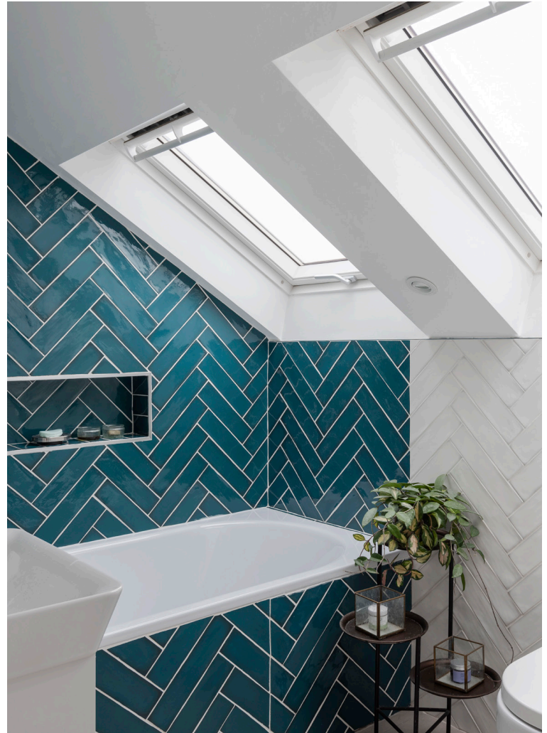
ENSUITE TO PRIMARY BEDROOM